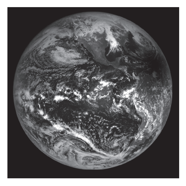
A GOES 10 Visible Image as seen in February, 1998.

Polar Operational Environmental Satellite system and relayed to a search and rescue ground terminal. The combined data are used to perform effective search and rescue operations.