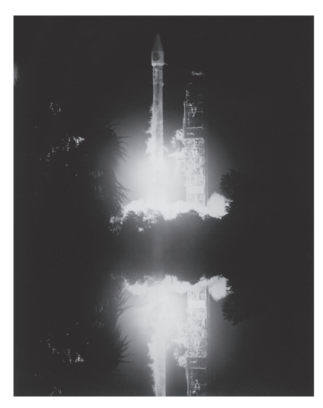
The Atlas 1 (AC-73) carrying the GOES-I weather satellite, the first of five next-generation advanced weather satellites for NOAA, was launched from Launch Complex 36B at Cape Canaveral Air Force Station, Florida, on April 13, 1994, at 2:04 a.m. EDT.

precise and timely weather observation and atmospheric measurement data for the United States than ever before possible. GOES-8 is located at 75 degrees West longitude, overlooking the East Coast of North and South America and the Atlantic Ocean. GOES-I was renamed GOES-8 after achieving orbit and is still actively collecting data.