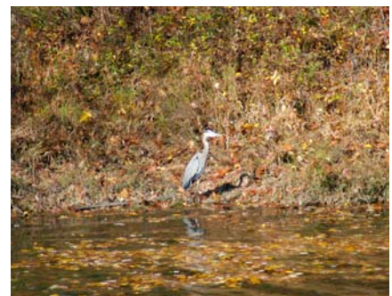
Great blue heron at Pohick Site 3.