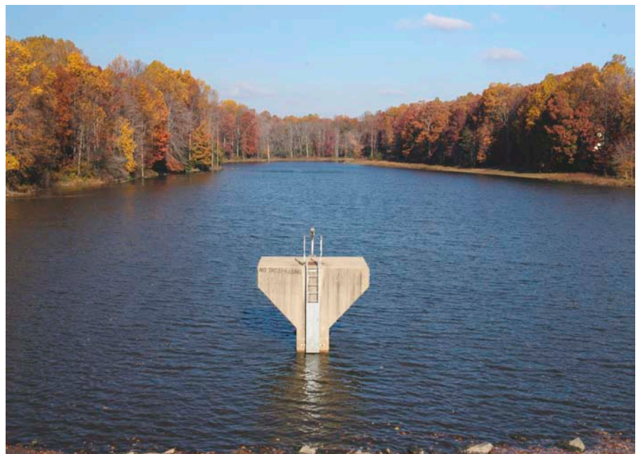
Site 3 protects hundreds of residents from flooding.

Funded through the American Recovery and Reinvestment Act (ARRA) of 2009, this project is part of the Obama Administration's plans to modernize the nation's infrastructure, jump-start the economy, and create jobs. NRCS is using Recovery Act dollars to update aging flood control structures, protect and maintain water supplies, improve water quality, reduce soil erosion, enhance fish and wildlife habitat, and restore wetlands. NRCS acquires easements and restores floodplains to safeguard lives and property in areas along streams and rivers that have experienced flooding.