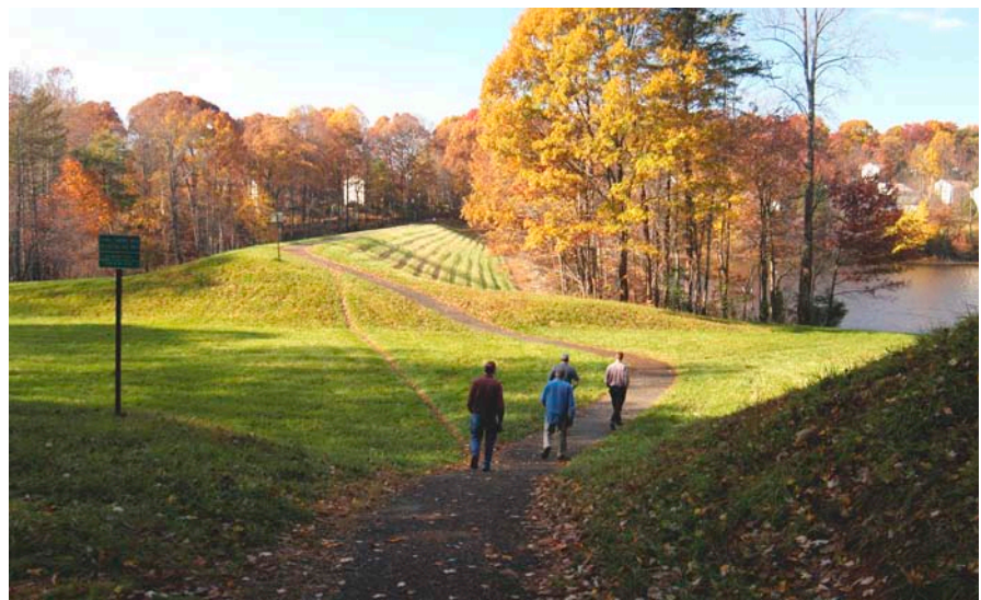
Homeowners in this Fairfax County neighborhood rely on Pohick Site 3 for flood protection.