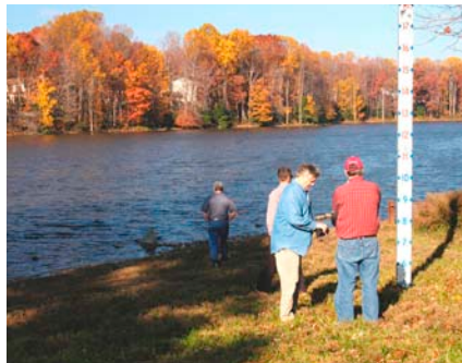
Measuring rod on Site 3 shows when water levels rise.

USDA, NRCS 1606 Santa Rosa, Suite 209 Richmond, VA 23229 (804) 287-1691 www.va.nrcs.gov