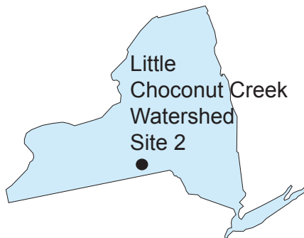
The Little Choconut Creek Watershed Site 2 is located in Broome County, New York.

This dam rehabilitation project will create or save jobs and provide flood protection for the Town of Union and the City of Binghamton. The project will make the dam compliant with current safety criteria. During and after floods, it will prevent injury or disease, reduce need for emergency personnel, and prevent disruption of community services.