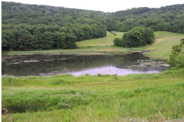
Flood pool of Little Choconut Site 2 will have the sediment removed.

USDA, NRCS The Galleries of Syracuse 441 South Salina Street, Suite 354 Syracuse, New York 13202-2450 Fax: 315-477-6560 www.ny.nrcs.usda.gov