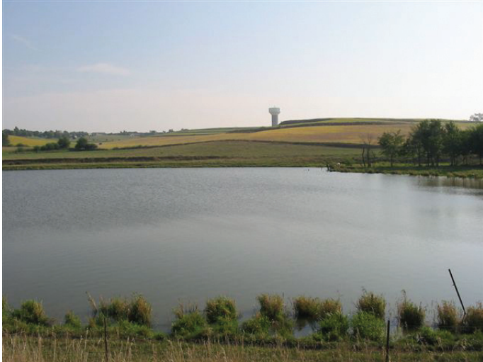
This view is from on top of the dam showing the water pool. On the horizon is the approaching urban expansion.