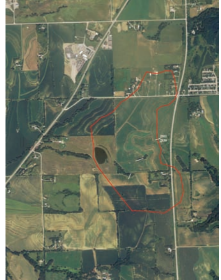
The drainage area protected by the flood control structure is shown outlined in red on the aerial map above. It encompasses over 270 acres.

USDA, NRCS Federal Building, Room 152 100 Centennial Mall North Lincoln, NE 68508-3866 (402) 437-5300 www.ne.nrcs.usda.gov