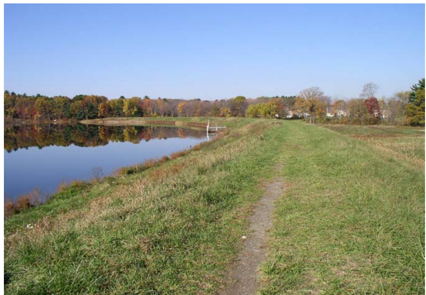
The George H. Nichols Dam in Westborough, Massachusetts provides flood protection and recreational benefits.

Funded through the American Recovery and Reinvestment Act (ARRA) of 2009, this project is part of the Obama Administration's plans to modernize the nation's infrastructure, jump-start the economy, and create jobs. NRCS is using Recovery Act dollars to update aging flood control structures, protect and maintain water supplies, improve water quality, reduce soil erosion, enhance fish and wildlife habitat, and restore wetlands. NRCS acquires easements and restores floodplains to safeguard lives and property in areas along streams and rivers that have experienced flooding.