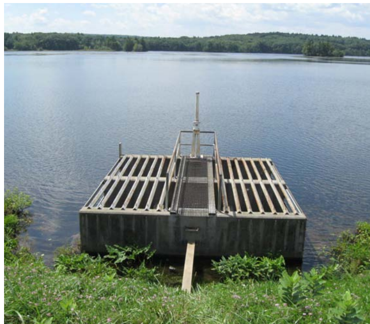
Spillway inlet at the George H. Nichols dam.

USDA, NRCS 451 West Street Amherst, MA 01002-2953 (413) 253-4350 www.ma.nrcs.usda.gov