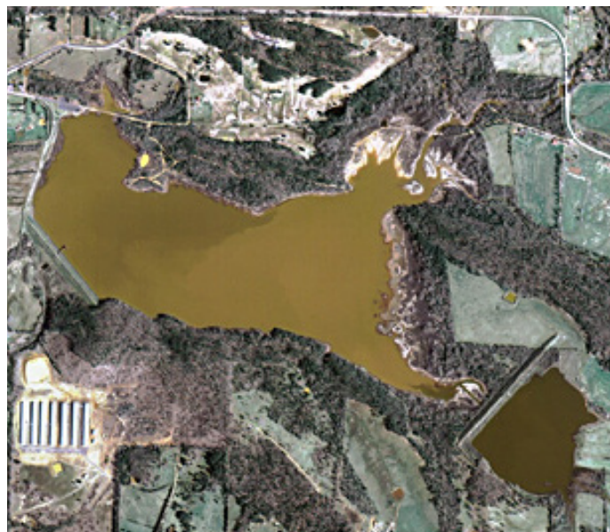
An aerial view of Site 5 of the Poteau River Watershed northeast of Waldron, Ark.

Funded through the American Recovery and Reinvestment Act (ARRA) of 2009, this project is part of the Obama Administration's plans to modernize the nation's infrastructure, jump-start the economy, and create jobs. NRCS is using Recovery Act dollars to update aging flood control structures, protect and maintain water supplies, improve water quality, reduce soil erosion, enhance fish and wildlife habitat, and restore wetlands. NRCS acquires easements and restores floodplains to safeguard lives and property in areas along streams and rivers that have experienced flooding.