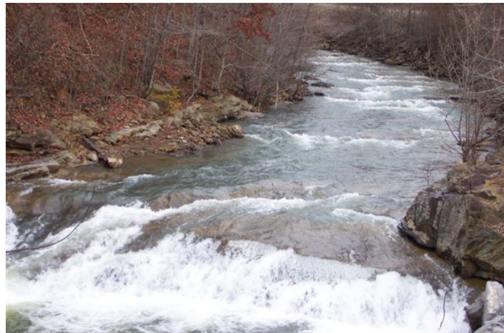
Twenty nine species of mussels and 19 species of rare fish are found in the North Fork Powell River drainage.

The project will improve water quality for downstream residents and also improve aquatic habitat for 22.95 miles of fisheries and 15 threatened and/or endangered species of freshwater mussels and fish. It will create wetlands and improve wildlife habitat on approximately 64 acres. Overall, the project will improve water quality, create recreational opportunities, and improve economic opportunities for the region.