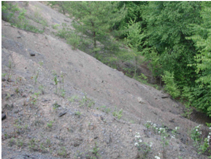
Project will reduce 252 tons of sediment delivered to streams annually.