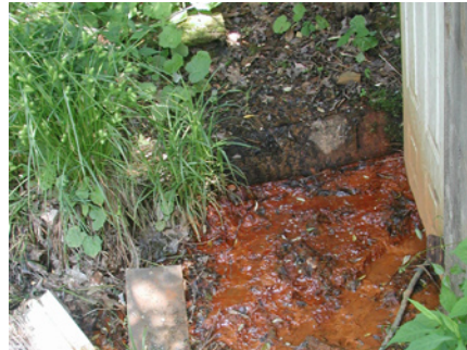
Measures will be installed to treat acid mine drainage.