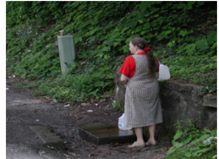
Residents will not have to travel long distances for clean water.