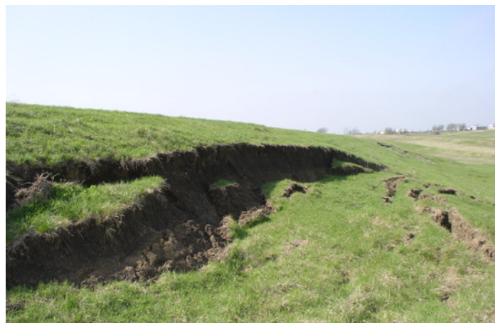
Soils have slid down the dam as a result of periods of heavy rainfall following extended drought.