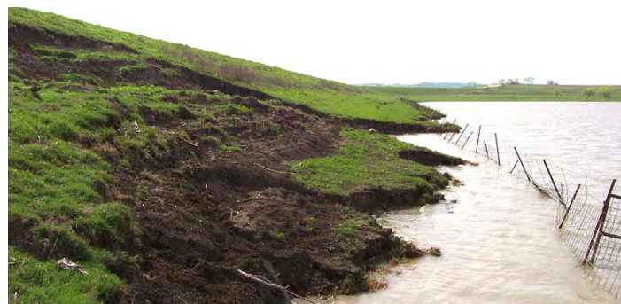
Slope slides like this will be repaired by removing the soil, treating with lime, and replacing to stabilize the slopes.