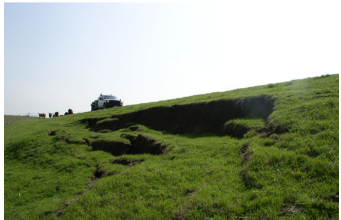
Repairing dams will ensure they are safe, providing benefits for years to come.

USDA, NRCS 101 South Main Temple, TX 76501 Phone: 254-742-9800 www.tx.nrcs.usda.gov