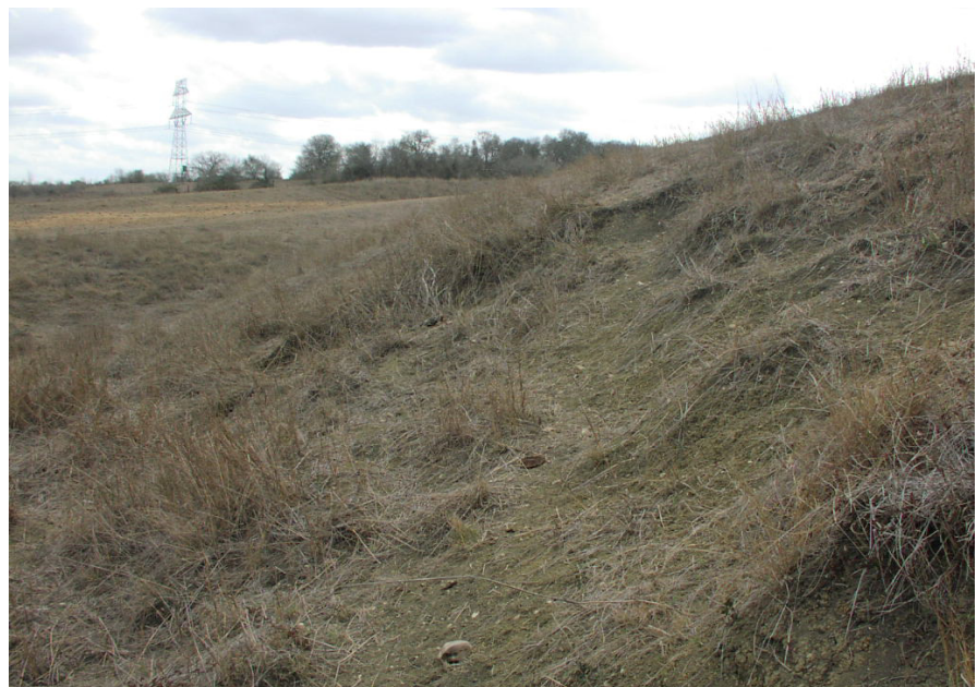
Soils have slid down the dam as a result of periods of heavy rainfall following extended drought.

Funded through the American Recovery and Reinvestment Act (ARRA) of 2009, this project is part of the Obama Administration's plans to modernize the nation's infrastructure, jump-start the economy, and create jobs. NRCS is using Recovery Act dollars to update aging flood control structures, protect and maintain water supplies, improve water quality, reduce soil erosion, enhance fish and wildlife habitat, and restore wetlands. NRCS acquires easements and restores floodplains to safeguard lives and property in areas along streams and rivers that have experienced flooding.