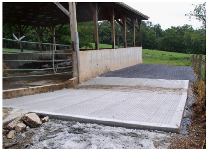
After animal walkway was installed.

The ARRA funding will help install conservation practices such as animal walkways to prevent non-point agricultural pollution in the Tulpehocken Creek.