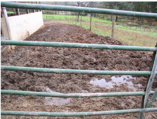
Before animal walkway was installed.

USDA, NRCS One Credit Union Place, Ste. 340 Harrisburg, Pennsylvania 17110-2993 Phone: 717-237-2100 www.pa.nrcs.usda.gov