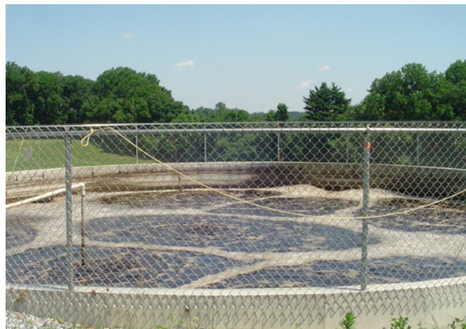
This mushroom wharf runoff waste storage facility with aeration treatment will be recycled to make mushroom substrate and keep contaminants out of the Red-White Clay Creeks.

This project will improve seven miles of stream, reduce significant amounts of soil erosion deposits, and properly manage agricultural wastes. Installation of the planned conservation practices will improve public health and safety, along with enhancing visual and aesthetic values. The bog turtle habitat and other fish and wildlife habitat will thrive. This project will sustain and protect important farmland, increase biodiversity, improve livestock health, increase property values, and add to local tourism.