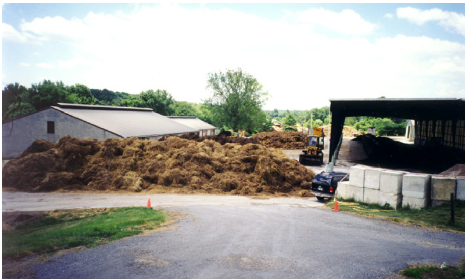
Mushroom substrate processing area in need of waste runoff collection and storage measures. ARRA funds will accelerate implementation of these and other related watershed projects.

USDA, NRCS One Credit Union Place, Ste. 340 Harrisburg, Pennsylvania 17110-2993 Phone: 717-237-2100 www.pa.nrcs.usda.gov