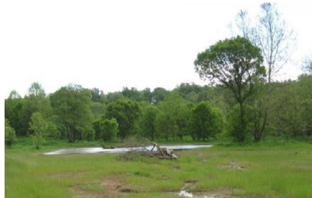
After wetland mitigation.