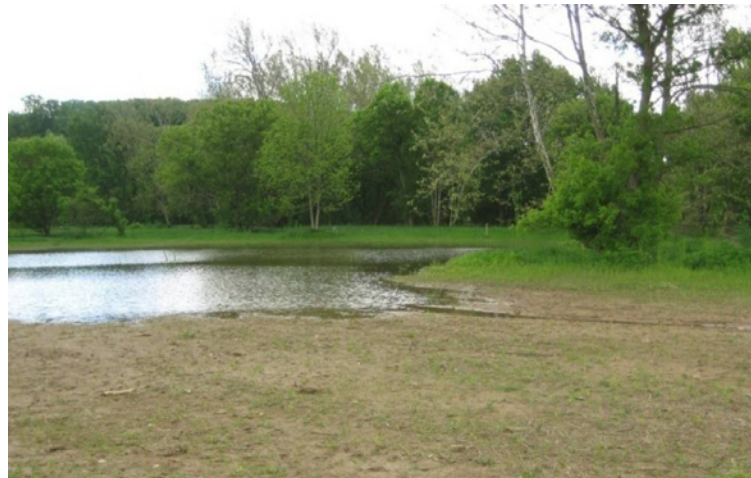
Wetland areas in the Brandywine Creek Watershed improve wildlife habitat, control flooding, and create open space.

Residents near the mitigation site and the project sponsor will benefit through improved wildlife habitat and open space.