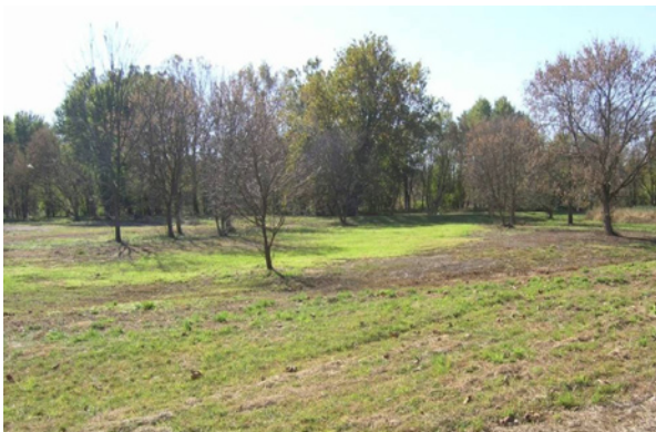
Before wetland mitigation.

USDA, NRCS One Credit Union Place, Ste. 340 Harrisburg, Pennsylvania 17110-2993 Phone: 717-237-2100 www.pa.nrcs.usda.gov