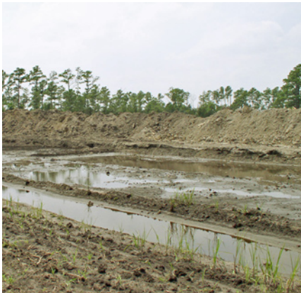
Earthen dike under construction.

USDA, NRCS 4407 Bland Road., Suite 117 Raleigh, North Carolina 27609 Phone: 919-873-2100 www.nc.nrcs.usda.gov