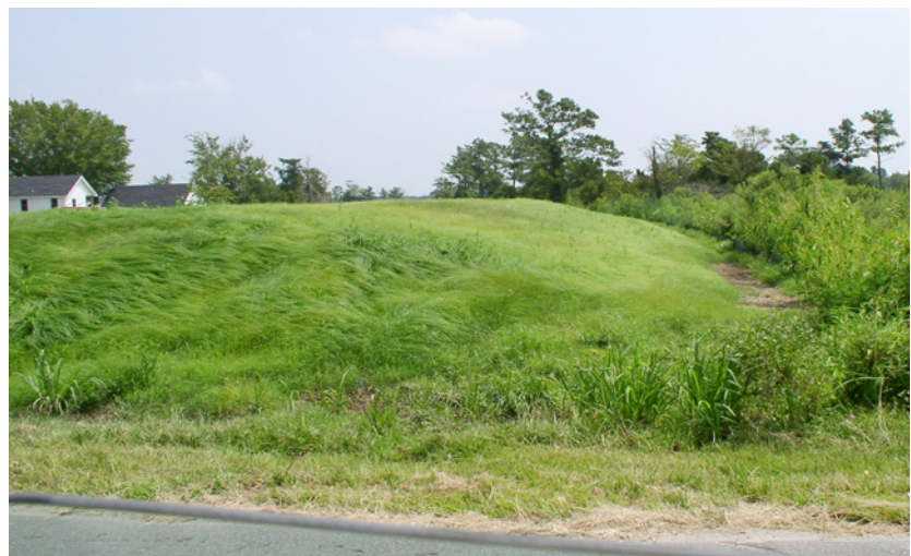
A completed portion of the earthen dike protecting the Village of Swan Quarter.

The economic impact of repeated flood damages threatens the long term viability of this community. The project will reduce flood damages to 120 homes and businesses, decrease utility and community service disruptions, and protect farmland from being flooded and contaminated by saltwater.