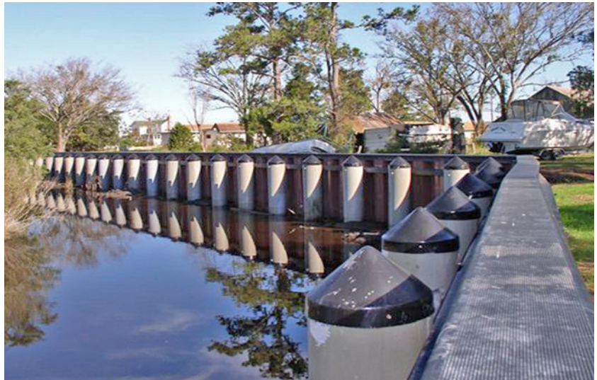
A floodwall was installed in a previous phase to protect the Village of Swan Quarter to minimize effects on adjacent wetlands.