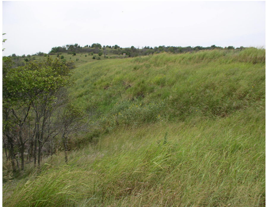
The downstream slope of the dam on Site 18 has experienced two slope failures since the fall of 2006.

USDA, NRCS 760 South Broadway Salina, Kansas 67401 Phone: 785-823-4500 Fax: 785-823-4540 www.ks.nrcs.usda.gov