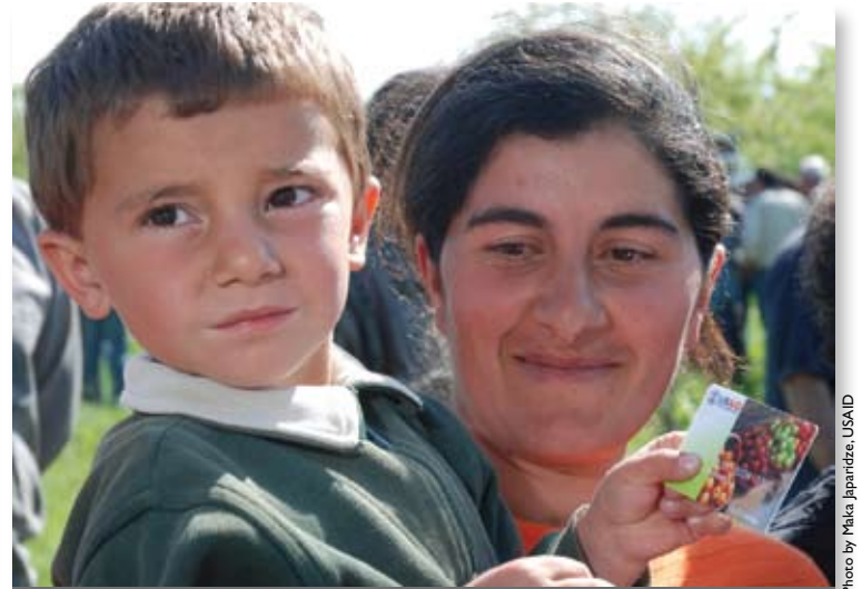
A child holds one of USAID’s electronic vouchers.