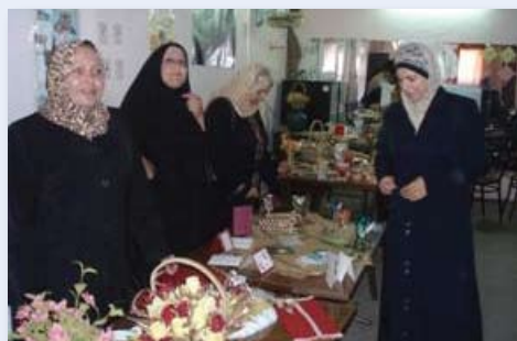
Women from the USAID-supported Ray of Light program in Jordan have assisted themselves and others.

She began working for a USAID-supported program