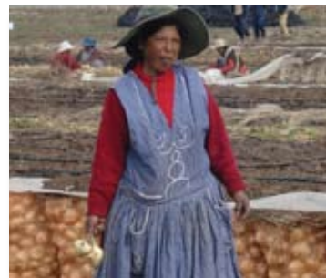
Local producers tend to crops of organic sweet onions, which flourish on once-barren land in the Bolivian Andes region of Oruro.

Although these varieties of onions had not been previously grown in this region, the area’s loose sandy soil, which contains little sulfur, is ideal for sweet onions.