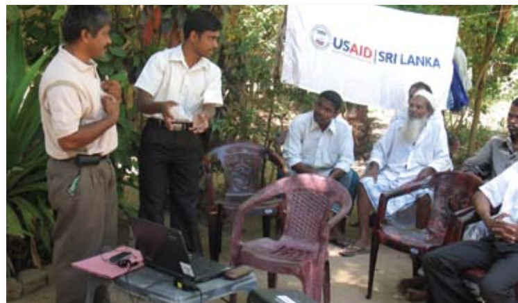
A Hayleys training manager, assisted by a translator, uses equipment provided by USAID to explain the importance of land preparation and water management for a good harvest to Tamil, Muslim, and Sinhalese farmers during a training program in eastern Sri Lanka.

Farmers in the eastern districts of Ampara and Moneragala