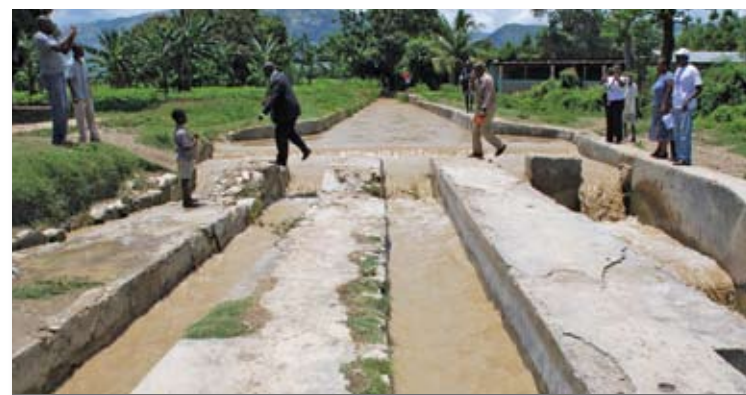
Water intake system that feeds the irrigation canals of Plaine du Cul de Sac.

Similar engineering projects to control flooding and reclaim land on hillsides and in plains can be found in Gonaives, around Port-au-Prince, and elsewhere in Haiti. It is all part of a visionary scheme for the island that is working from ravine to reef to restore the productivity of Haiti's land. ★