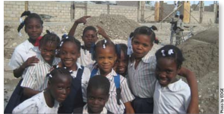
Students at the Ecole Nationale Belfond Pierre in Gonaives. In the background are classrooms being constructed by USAID.

To rebuild and expand the Ecole Nationale Belfond Pierre, IOM employs local talent, providing people from Gonaives