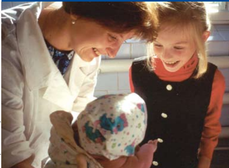
A neonatologist in Velikiy Novgorod introduces a girl to her healthy newborn brother.