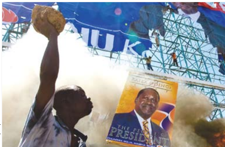
In this photo from Kenya Burning , a supporter of Raila Odinga stands before a burning banner of Mwai Kibaki following the December 2007 presidential election. The book contained no captions, allowing the images to speak for themselves.

This year the policing program awarded 200 scholarships for young people to attend the National Training Center and for study in local private schools, including basic electrician training. The program is also working with the municipality of Villa Nueva this year to train staff of the newly founded Youth Secretariat in youth leadership development. ★