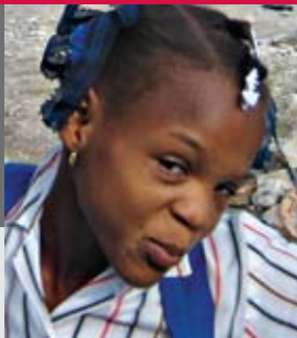
This girl attends a school in Gonaives, Haiti, where USAID is building new classrooms.

Haiti is rebuilding following last year's storms. See pages 8-9.