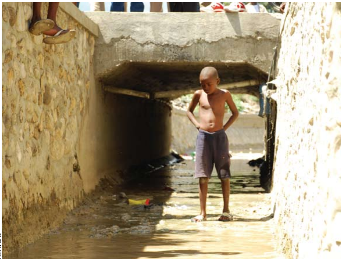
Part of an extensive network of canals being refurbished in the Plaine du Cul Sac area. During heavy rains, the water level typically rises beyond the height of this child.