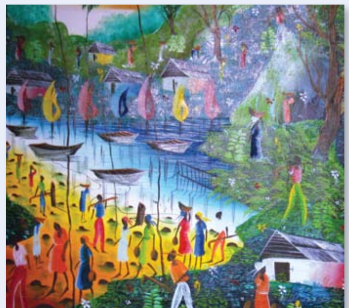
Haitian painting depicting the nation’s colorful tropical landscape.