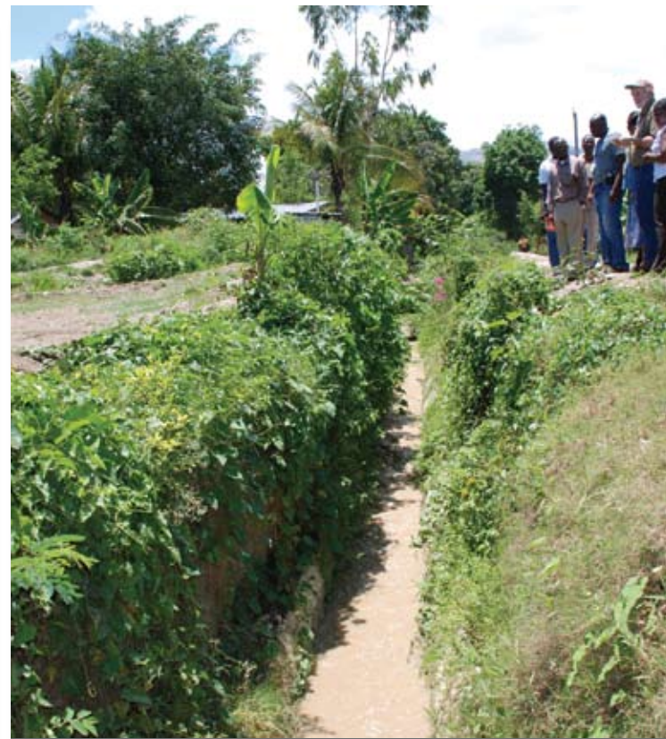
This irrigation system had been buried under three meters of silt and mud. USAID projects are helping to restore the productivity of Haiti's land.