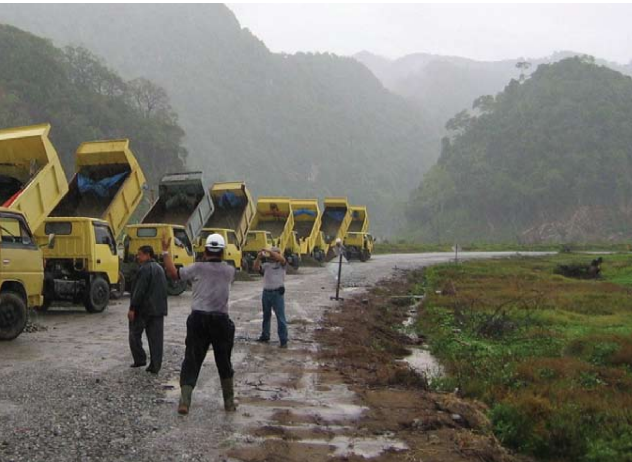
CAROLINE GREGLER, USAID

Reconstruction of the north-south road through Aceh Province in Indonesia. The project is injecting much-needed cash into the economy while facilitating the long-term growth of local business and commerce.