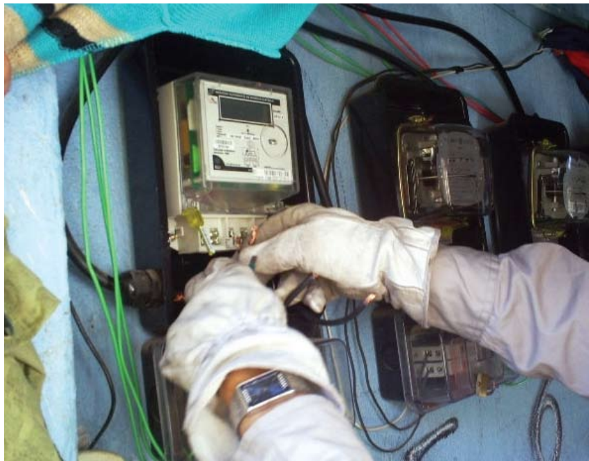
USAID Electricity sector reform, including meters to measure and charge for power use, is expanding electricity service to slum households and businesses in Sao Paulo, Brazil.

in these five program objectives are intended to be complementary and mutually reinforcing. For example, country evidence suggests that political democracy can help strengthen economic governance, though the East Asian experience makes clear that democracy is not a precondition for growth, and the initial period of a democratic transition often yields slow or negative growth. 46 Similarly, improved health contributes to faster growth through its impact on educational attainment, savings rates, and worker productivity. 47 Together, these efforts contribute toward the overall goal of U.S. foreign assistance in each country category.