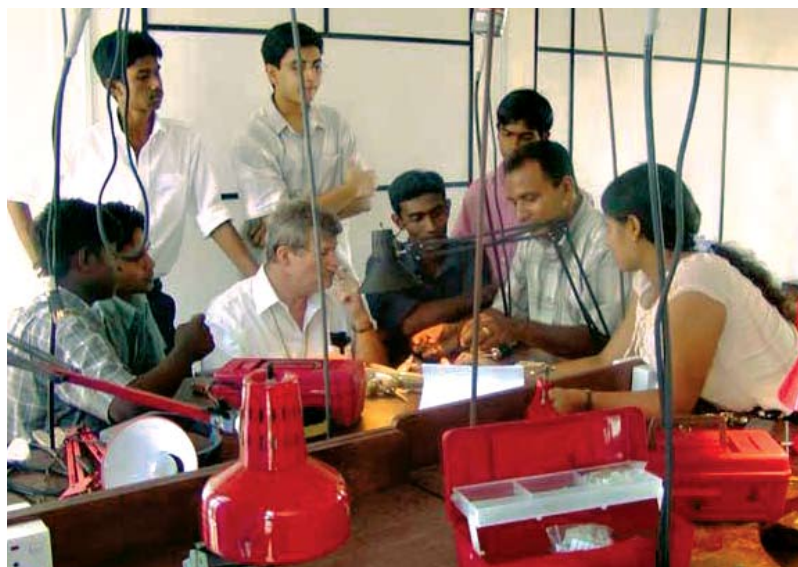
J.E. AUSTIN ASSOCIATES, INC.

Most poor countries have learned the principal macroeconomic lessons and made the basic reforms. As more and more governments have come to recognize the harm imposed by high inflation, for example, hyperinflation has almost disappeared. In fact, most countries have reduced inflation below 10 percent. The previously widespread and damaging use of multiple exchange rates has also become rare. In addition, most governments have learned that stability requires that deficits be controlled, and that openness to the international economy contributes to growth.