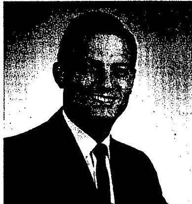
Albert "Bud" Wheelon, 1966. (U)

“ Wheelon developed three new satellite systems that formed the backbone of the Agency's overhead program for...decades. Perhaps even more extraordinary...[he] was only 34 when he became DDS&T. ”