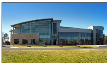
Brookhaven's Center for Functional Nanomaterials

The Brookhaven Center for Functional Nanomaterials (CFN) will be a hub for cutting-edge nanoscience studies. The scientific goals of the CFN are primarily aligned with addressing our national challenges in energy. Nanostructured materials may enable energy-efficient processes and devices for alternatives to fossil fuels, in the form of efficient catalysts, fuel cells, photovoltaic (solar cell) elements, or solid-state lighting. Research programs in the CFN focus on three key areas: