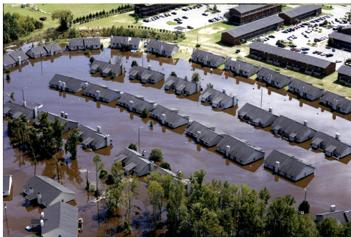
Flooding in Greenville, NC from the Tar River caused by Hurricane Floyd in September of 1999.