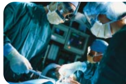
Virtual surgery simulation technology enables surgeons to rehearse specific procedures for individual patients, improving preparedness and reducing error.

The innovation: New imaging technologies are allowing physicians to see diseases earlier, diagnose them more accurately, and provide minimally invasive treatment options to patients in lieu of major surgery. Because of an all-digital amorphous silicon (a-Si) based technology developed by General Electric (GE), physicians at hospitals across the nation now have access to images with unprecedented detail and clarity. This technology converts X-ray signals into digital images at the point of acquisition to produce images that give physicians a new level of clinical accuracy.