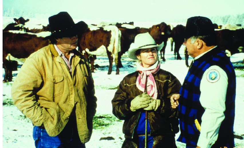
Ranchers and producers depend on WS for assistance in resolving livestock depredation complaints.

to benefit all of America. While these dollar estimates are conservative, these studies highlight the importance of WS' work.