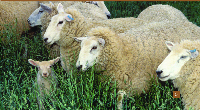
Ranchers experience the majority of livestock losses in the spring and early summer, when young lambs are too small to fend off predator attacks.

In increasing numbers, livestock producers are using guard animals in their pastures and on