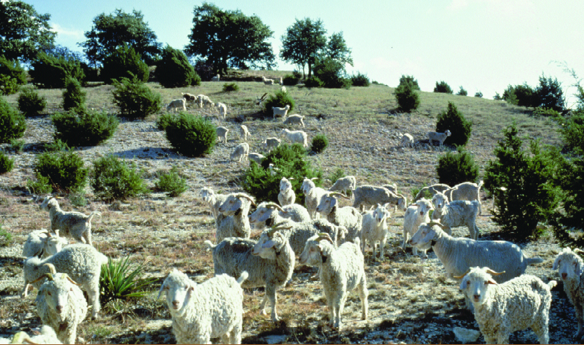
Sheep grazing on open rangeland are especially vulnerable to predator attacks because coyotes, wolves, and cougars roam the same territory.

losses to predators and 61 percent of sheep and lamb predation. While some ranchers and livestock producers experience only minimal livestock losses, others must deal with serious predation. In Western States like Idaho and Utah, where livestock usually graze on open rangelands, lambs and calves are especially vulnerable to predators.