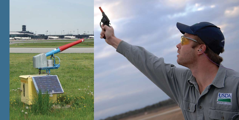
Figures 7–8. Active dispersal of wildlife remains critical to managing wildlife at airports.

The Wildlife Services (WS) program, within the U.S. Department of Agriculture’s Animal and Plant Health Inspection Service, offers consultation and management assistance to assess wildlife conflicts at airports and