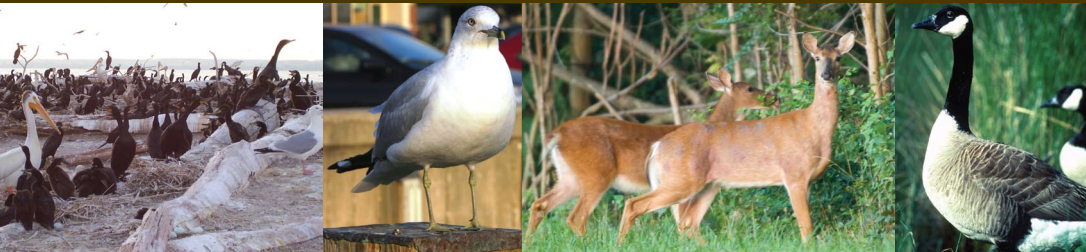
Figures 1–4. Populations of some species commonly involved in aircraft strikes have increased significantly in recent decades (pelican and cormorant, gull, deer, geese).

Professional biologists within Wildlife Services’ Airport Wildlife Hazards Program work closely with the military, the civil aviation industry, and the U.S. Department of Transportation’s Federal Aviation Administration to reduce the economic impacts and safety risks to aviation caused by birds, mammals, and other wildlife.