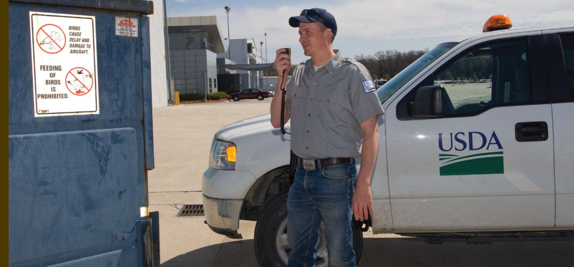
Figure 6. Food and shelter attractants for wildlife must be controlled in varied airport locations.