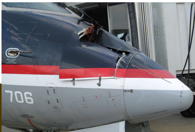
Figure 10. Bird strikes can damage military and civilian aircraft: this CRJ-700 struck a black vulture on final approach.

WS provides assistance to people experiencing problems caused by wildlife. The mission of WS is to protect