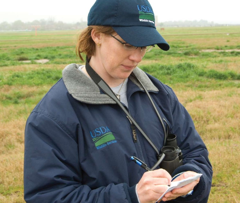
Figure 9. A Wildlife Hazards Assessment often acts as the first step to improving wildlife management.

agriculture, property, natural resources, and human health and safety from wildlife damage. The WS Airport Wildlife Hazards Program works closely with the FAA, U.S. military, and the civil aviation industry to research wildlife hazards at airports and reduce the economic impacts and hazards to aviation caused by wildlife.