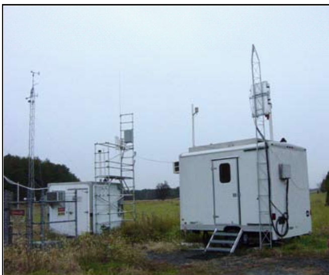
NOAA's mercury speciation equipment placed at Beltsville, Maryland.

atmospheric and terrestrial processes and factors (i.e., wind, temperature, surface roughness) controlling air-surface exchange of these compounds. Data from both AIRMoN and field studies are used to improve and evaluate modeling products.