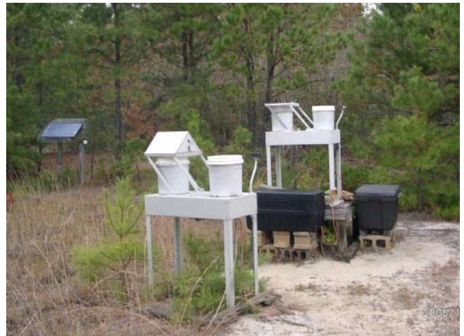
An AIRMoN station at Lewes, Delaware.

To complement deposition monitoring, ARL conducts short-term field studies that test emerging chemical measurement technologies and improve the understanding of the