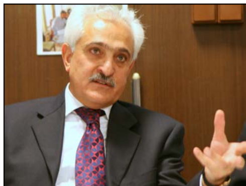
Afghan Foreign Minister Spanta gives an interview to Radio Free Afghanistan on Jan..

On Jan. 28, Radio Free Afghanistan broadcast a wide-ranging interview with Afghan Foreign Minister Rangin Dadfar Spanta, during his visit to Prague for meetings with European Union leaders. In the interview, Spanta insisted that relations with the new U.S. administration are not strained.