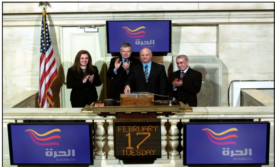
Alhurra representatives ring the opening bell at the New York Stock Exchange on Feb. 17. The event was timed to mark Alhurra’s five-year anniversary.