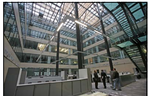
An inside look at the 236,000 square foot building.

the project. "We could not have done this without the crucial support of the Czech government, the U.S. Congress, and the U.S. embassy in Prague," he said. "The BBG is delighted that RFE/RL employees, who broadcast in 28 languages to 20 countries via radio, TV and the Internet, will now have a state-of-the-art headquarters to meet their needs."