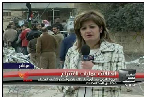
Alhurra presented on-the-ground reports from Iraq's first election since 2005.

VOA's Kurdish Service provided comprehensive coverage of elections in 14 of Iraq's 18 provinces through on-the-ground coverage by stringers and interviews with candidates, politicians and citizens.