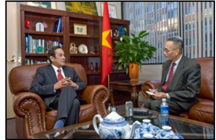
An RFA reporter speaks with the Vietnamese ambassador.