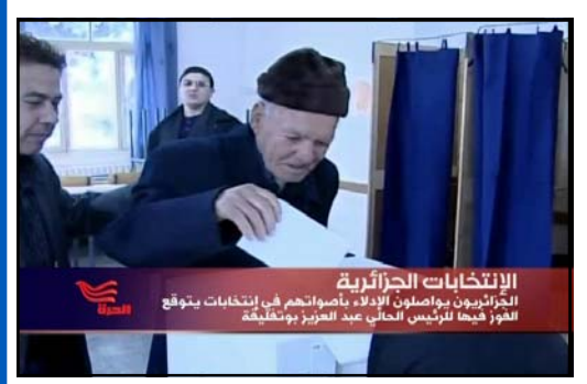
An Algerian man votes during the country's April 9 presidential elections.

reporting on the Algerian presidential election on April 9. Alhurra and Radio Sawa had live updates from Algeria and analysis from the Middle East and the United States. With wide-ranging coverage, Alhurra