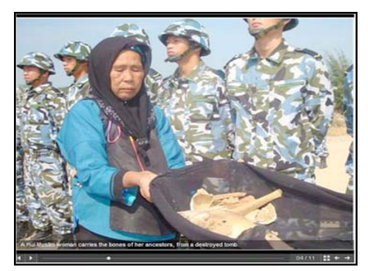
A Hui Muslim woman carrying bones of her ancestors from a destroyed tomb

The Cantonese service reported that villagers in a Muslim region of Sanya, Hainan province, staged a vigil to protect local Muslim tombs after several attempts by authorities to demolish them. Up to 2,000 villagers protested in late December when military