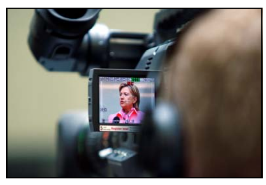
Secretary Clinton's visit was covered extensively by RFE/RL journalists.

Clinton also praised the many RFE/RL employees