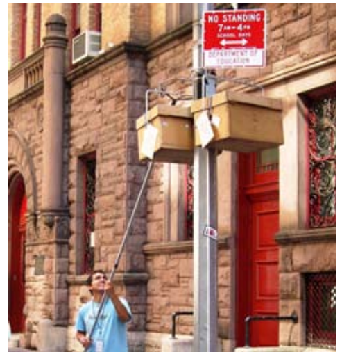
Deploying a tracer sampler in New York City.

FRD maintains two types of unique portable remote sensors (a radar wind profiler and two mini-sodars) that are used to acquire wind profiles in the atmospheric boundary layer. Radar wind profilers use radar pulses whereas sodars use pulses of sound to measure wind profiles. The radar profiler and sodars are used to support field experiments such as atmospheric tracer or air quality studies.