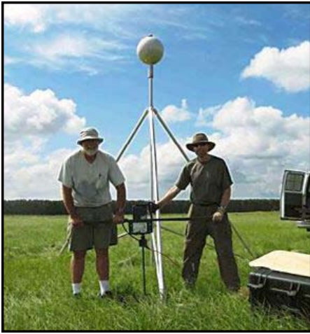
NOAA scientists setting a ground anchor for an ET Probe deployed in advance of Hurricane Ivan.