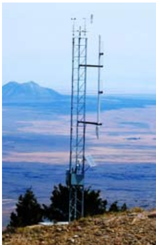
Meteorological tower on the summit of Big Southern Butte. INL mesonet

FRD is a pioneer in atmospheric tracer experiments, which date back to the 1960s. Tracer experiments involve the controlled release of a non-toxic gas at low concentrations and the subsequent tracking and measurement of the gas as it is transported and dispersed by the atmosphere. This "tracer" mimics the dispersion characteristics of an actual toxic gas release, thereby permitting evaluation of toxic gas dispersion models. FRD's most recent focus is on conducting tracer studies to understand wind flows in cities. This is important, for example, to national security if a toxic gas should be released during a terrorist event. Additionally, these tracer studies help air quality regulatory agencies understand dispersion of vehicle emitted pollution into neighborhoods near high-traffic roadways.