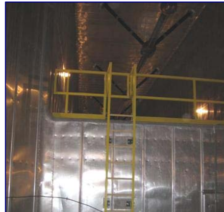
Fiberglass anchored ladder and metal guard rail approved by SPAWAR SMEs on elevated gallery in Helix House.

During the MPHAP Team’s initial survey at NCTS Cutler, they were told that the intense EM field generated within a Helix House during operation places material restrictions on any fall abatement resolutions introduced within range of the EM field. Because the supporting fixtures within the Helix House must not interfere with the broadcast signal, the primary construction material for both structures and fasteners is laminated wood as mentioned above. The MPHAP Team had to consider that materials for any permanently implemented fall hazard resolutions could not conduct or re-radiate an EM signal that would degrade the facility’s operability capability.