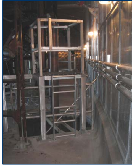
“Horn Gap” access platform surrounded by newly installed fall protection guard rails.

The MPHA Team generated and submitted design and fabrication drawings for their recommended fall hazard resolutions to NCTS Cutler safety and facility managers, maintenance technicians, and SPAWAR subject matter experts (SMEs) for review and comment. Proposed solutions included Occupational Safety & Health Administration compliant guardrails, swing gates, customized anchored ladders, raised platforms with guardrails, and mobile mechanized lifts. Guardrails were recommended for several locations to protect workers from falls greater than four feet while performing maintenance on high platforms or mezzanines within the Helix Houses. The custom anchored ladders would provide access to these and other high areas; the swing gates would provide fall protection at the top of the ladders. All of these solutions, with the exception of the mobile lifts were to be permanently mounted. The mobile lifts would be used to accomplish maintenance (i.e., cleaning system elements and structural inspections) at height in multiple locations within the Helix Houses