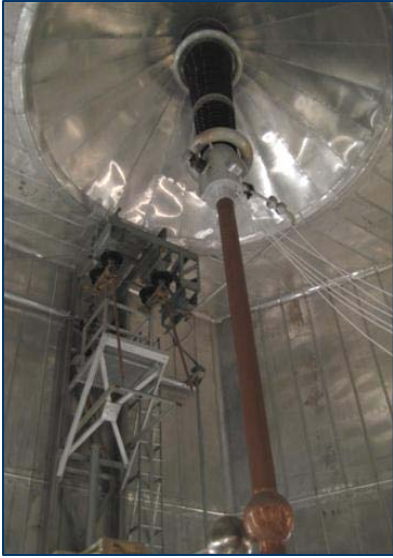
Customized anchored ladder and platform with fall protection guard rails provide safe access to deicing switch.

During cold weather, maintenance technicians must access the tuning capacitors within the Helix Houses as often as necessary to remove ice that has formed on the capacitor plates as icing adversely affects system operation. Maintenance technicians gained access to the de-icing switch platform via ladders that were unanchored, and the platform itself did not have fall protection guard rails.