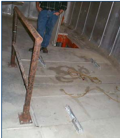
Trap door to lower section of Helix House was not surrounded by guard rails.

The “Horn Gap” is an area in the transmission circuit that requires periodic adjustment to maintain the proper frequency for the VLF. The “Horn Gaps” in each Helix House are located above an