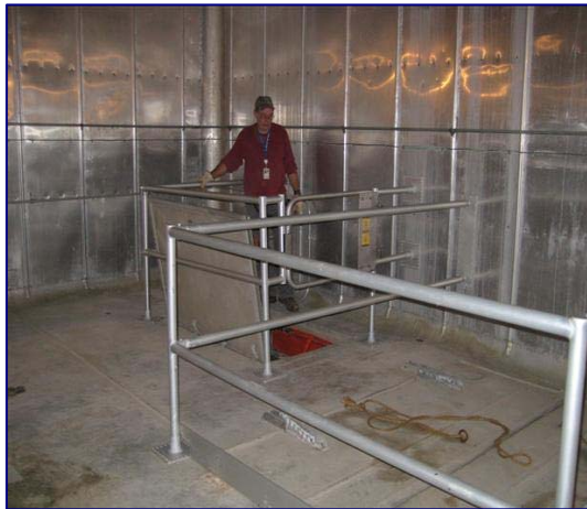
Large trap door (closed in foreground), separating one of the three divisions within the Helix House, is surrounded by a new safety rail.

where there was no place to anchor a ladder or construct a platform with guardrails.