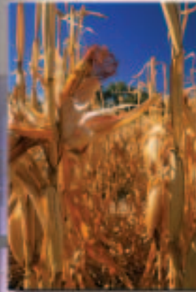
Current ethanol production is primarily from the starch in kernels of field corn. NREL researchers are developing technology to also produce ethanol from the fibrous material (cellulose and hemicellulose) in the corn husks and stalks or in other agricultural or forestry residues.