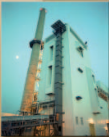
The Vermont gasifier, one of the first large-scale demonstrations of biomass gasification, supplies clean, renewable fuel from biomass to the McNeil Biomass Power Generating Station in Burlington, Vermont.

The Carbon-Rich Chains Platform. Plant and animal fats and oils are long hydrocarbon chains, as are their fossil-fuel counterparts. Some are directly usable as fuels, but they can also be modified to better meet current needs. Fatty acid methyl ester—fat or oil “transesterified” by combination with methanol—substitutes directly for petroleum diesel. Known as biodiesel, it differs primarily in containing oxygen, so it burns cleaner,