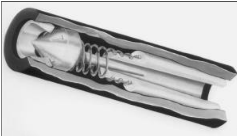
Excess flow valve.

Many gas distribution systems recognized more than 30 years ago that the major cause of accidents involving service lines was excavation damage. Those operators called on their equipment suppliers to develop a simple device capable of shutting off the flow of gas in service lines that experienced an abnormal flow increase.