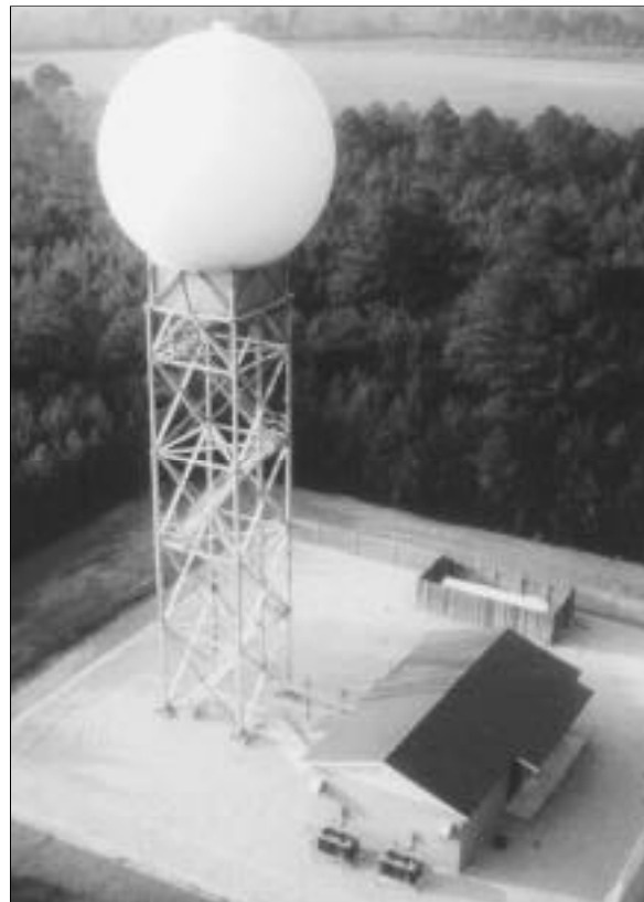
Windshear detector radar.

Because of these improvements, there has been only one windshear-related accident involving a transport-category aircraft in the United States in the last 13 years—the July 1994 DC-9 accident in Charlotte, North Carolina. A TDWR had not yet been installed at Charlotte. The Safety Board believes that the enhanced radar would have given controllers the opportunity to issue timely information to the flightcrew about the severity of the weather and may have prevented the accident. As of mid-1998, 37 TDWR facilities had been commissioned in airports throughout the country and the FAA is developing an advanced onboard weather detection system.