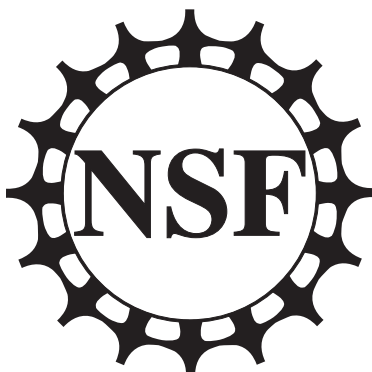
1-ink vector logo

The 1-ink vector logo is generally limited for use only when the task necessitates that only one ink be used, such as hot stamping on giveaway items. This logo is also approved for use on documents when use of the full color logo takes away from the artistic appeal or when the logo needs to be too small to see the letters clearly on the color logo. In these cases, it may only be used in black or white. There are no exceptions to color choice with this logo.