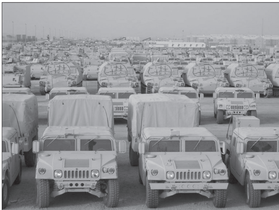
Figure 1: Existing Outdoor Storage in Kuwait

Inadequate storage facilities in both South Korea and Kuwait have resulted in outdoor storage of prepositioned equipment. Figure 1 shows the storage situation in Kuwait, with prepositioned equipment stored at outside locations.