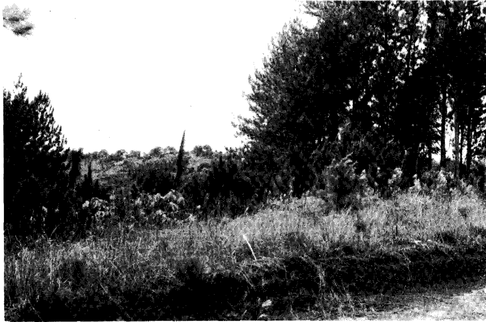
Figure 3.— Seedlings of Pinus caribaea invading an abandoned field next to a plantation in western Puerto Rico.