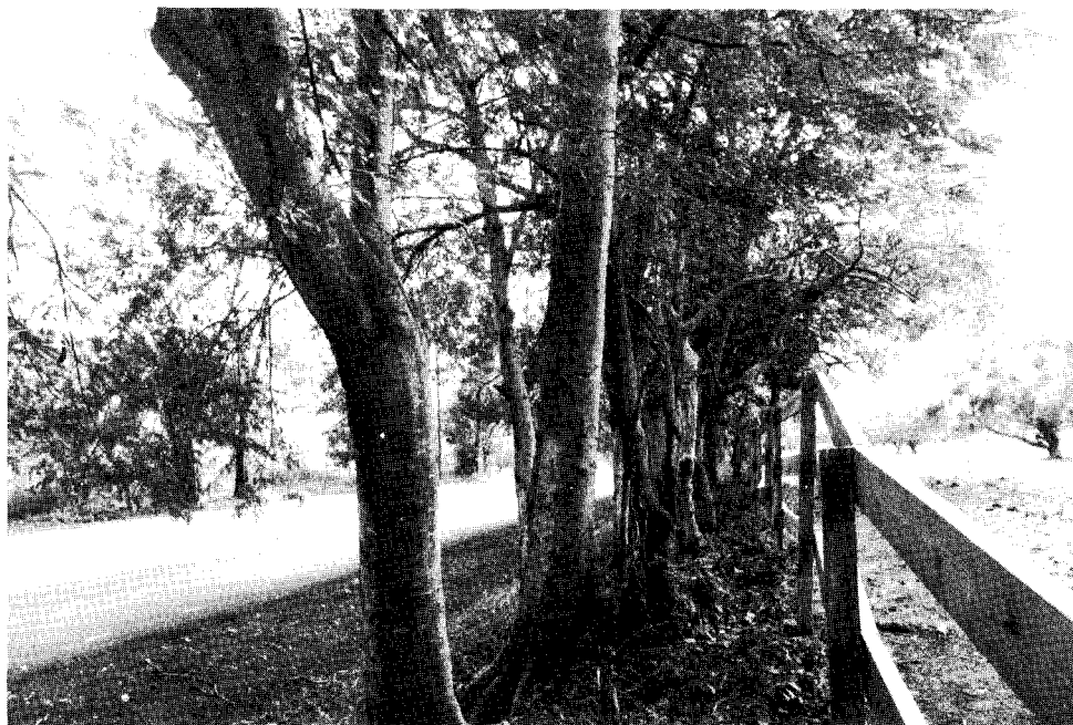
Figure 2.— L.-Naturalized Senna siamea and Melicoccus bijugatus with native Ficus citrifolia on roadside near Coamo, Puerto Rico.