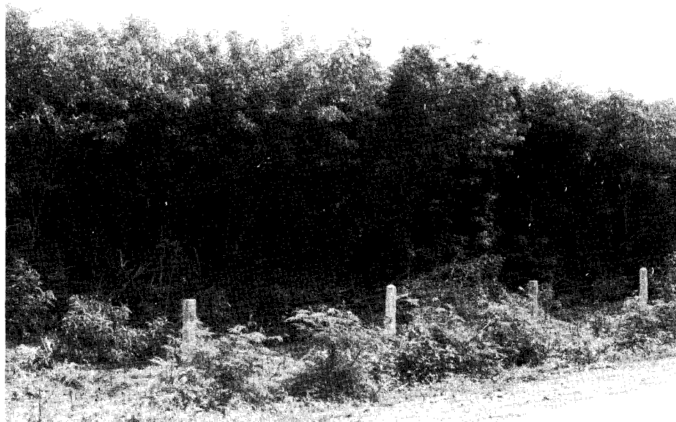
Figure 1.— Solid stand of Senna spectabilis that has invaded a former dry pasture near Penuelas, Puerto Rico.

could be the result of the invasion of a tree species under certain circumstances. As yet, neither has been documented in Puerto Rico. Each new addition to the plant community increases the local biological diversity. Tree species that remain noncompetitive or rare are of little concern, while those that become abundant and spread widely are more likely to have a significant impact. Species that have already become widespread and common or abundant are listed in table 2; those that are likely to do so within the next century are listed in table 3.