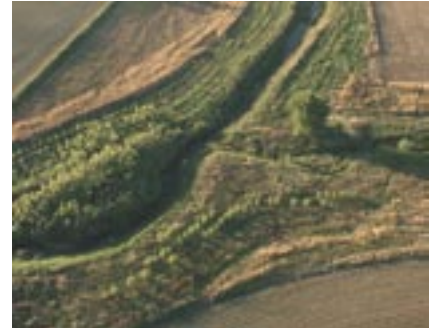
The riparian buffer along the stream is part of a nationally designated demonstration area for riparian buffers in Story County.