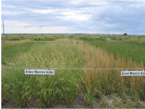
Aberdeen PMC Display nursery plots of Bromar (left) and Garnet (right).

'Bromar' was chosen from among 154 accessions collected in the Pacific Northwest and was released in 1946 cooperatively by Washington, Idaho and Oregon Agricultural Experiment Stations at Pullman, Moscow and Corvallis. It was selected for being taller, leafier and having better seedling vigor than commercial strains. It shows outstanding performance when planted in mixtures with sweetclover or red clover for short pasture rotations. Tests have shown Bromar to be moderately resistant to head smut, but chemical seed treatment is recommended. Breeder seed is maintained by the NRCS Plant Materials Center in Pullman, Washington and Foundation seed is produced by the Washington Crop Improvement Association.