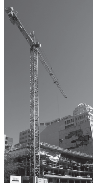
The Community Reinvestment Act encourages financial institutions to help meet the credit needs of their entire communities.