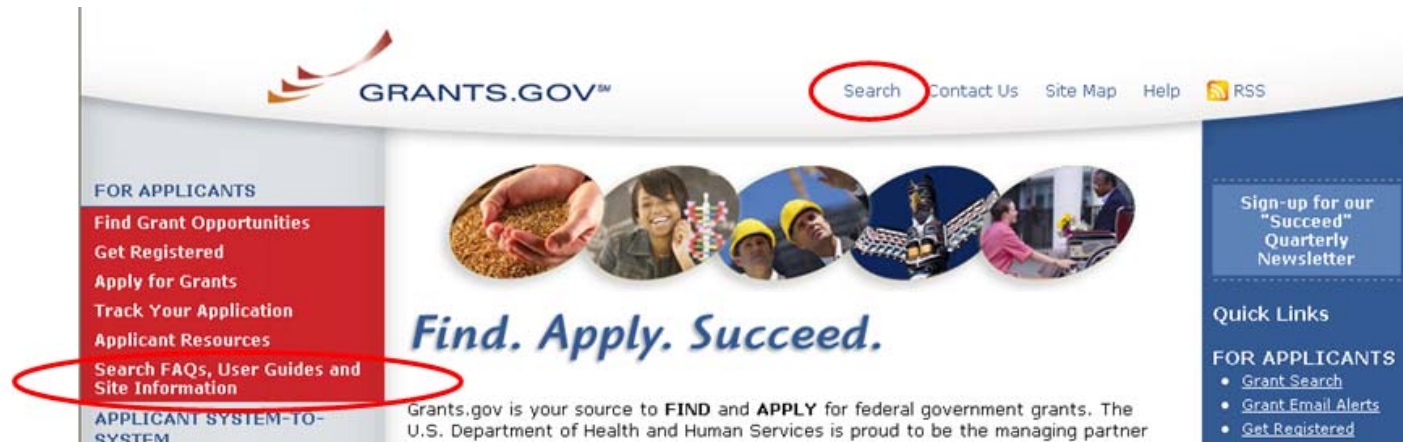
Figure 13 - Searching the Website – New Google Search

Finding information on the website is now easily accomplished with the newly added website search tool. The new search feature is powered by Google technology and will allow you to find information quickly and easily on the website. The search link is found at the top of the homepage under the For Applicant tab of the website's left navigation, see Figure 13 below.