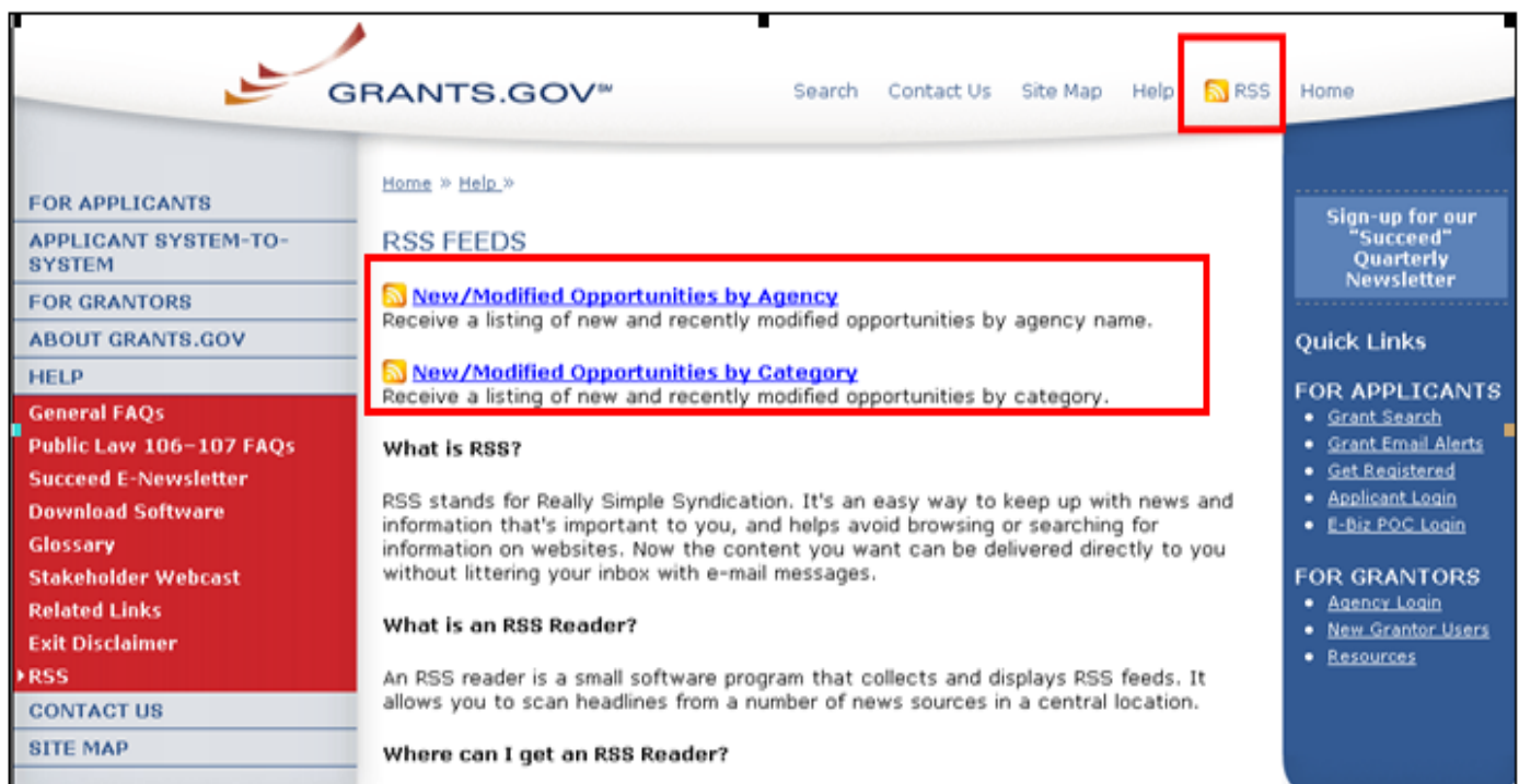
Figure 12- Notification of Opportunity Modification (RSS Feed)

The new RSS feeds allow the applicant to choose the frequency at which they receive notifications in one consolidated message as they are updated. Applicants may view opportunities by agency name or by category.