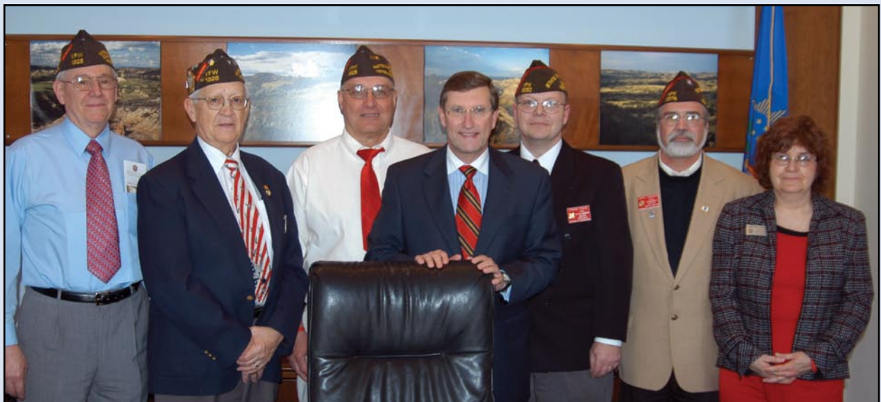
Senator Conrad meets with North Dakota Veterans of Foreign Wars representatives in his Washington, D.C. office.

Senator Conrad was an original cosponsor of legislation that would provide $20 million to expand access to VA health care for rural communities and establish an Assistant Secretary of Veterans Affairs for Rural Veterans. The Rural Veterans Care Act of 2006 has been referred to the Senate Committee on Veterans Affairs for consideration.