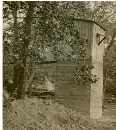
Iola streamgage in 1917