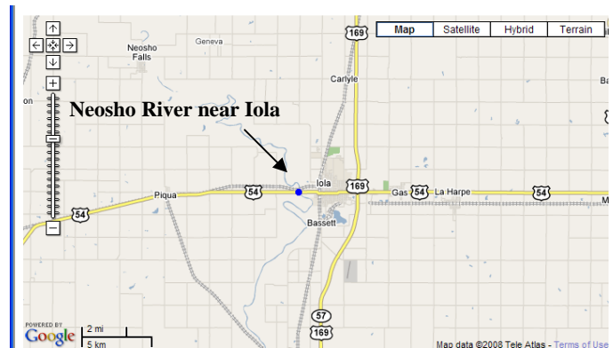
Location of Neosho River Iola streamgage