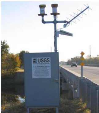
Neosho River near Iola streamgage