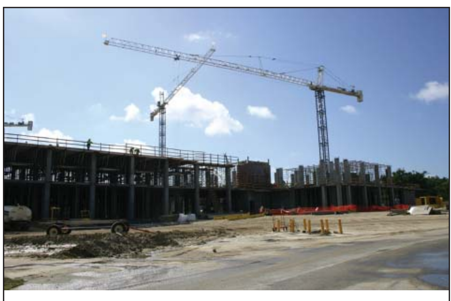
June 4, 2008