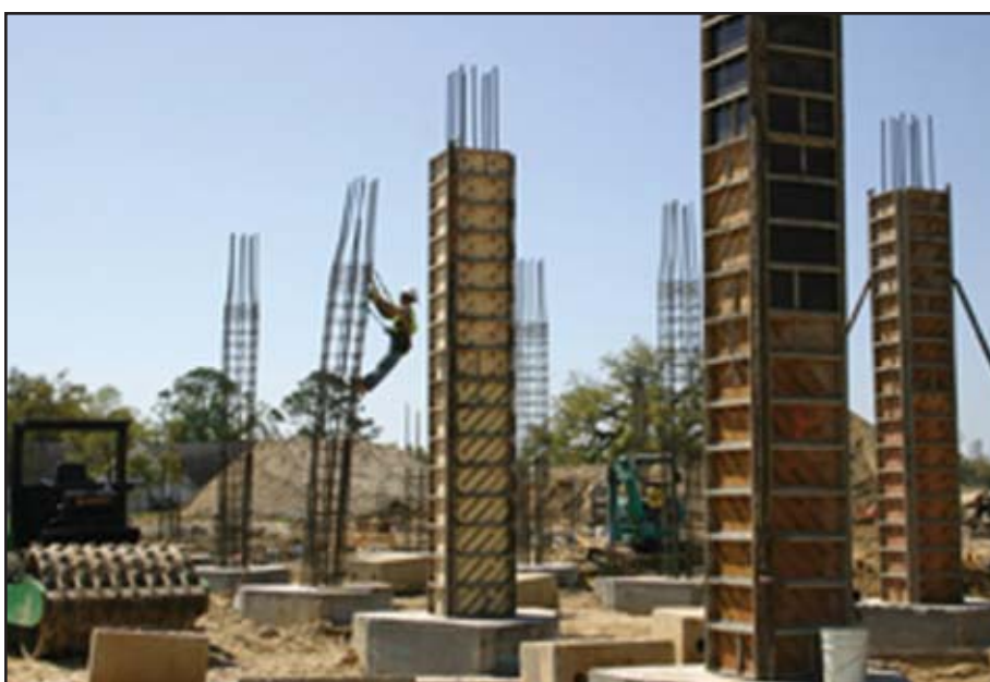
March 26, 2008