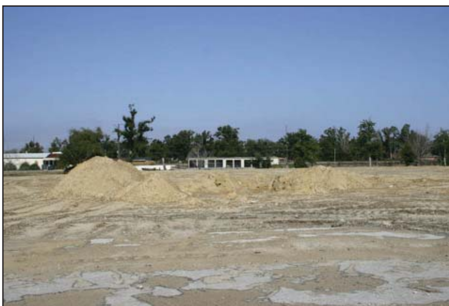
January 31, 2008