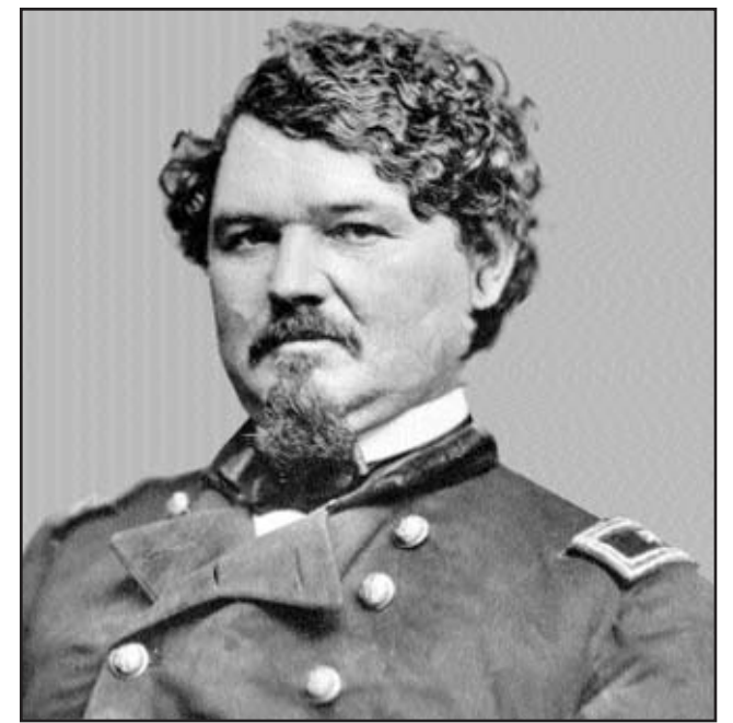
General Samuel Sturgis