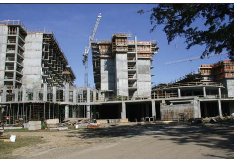
December 22, 2008