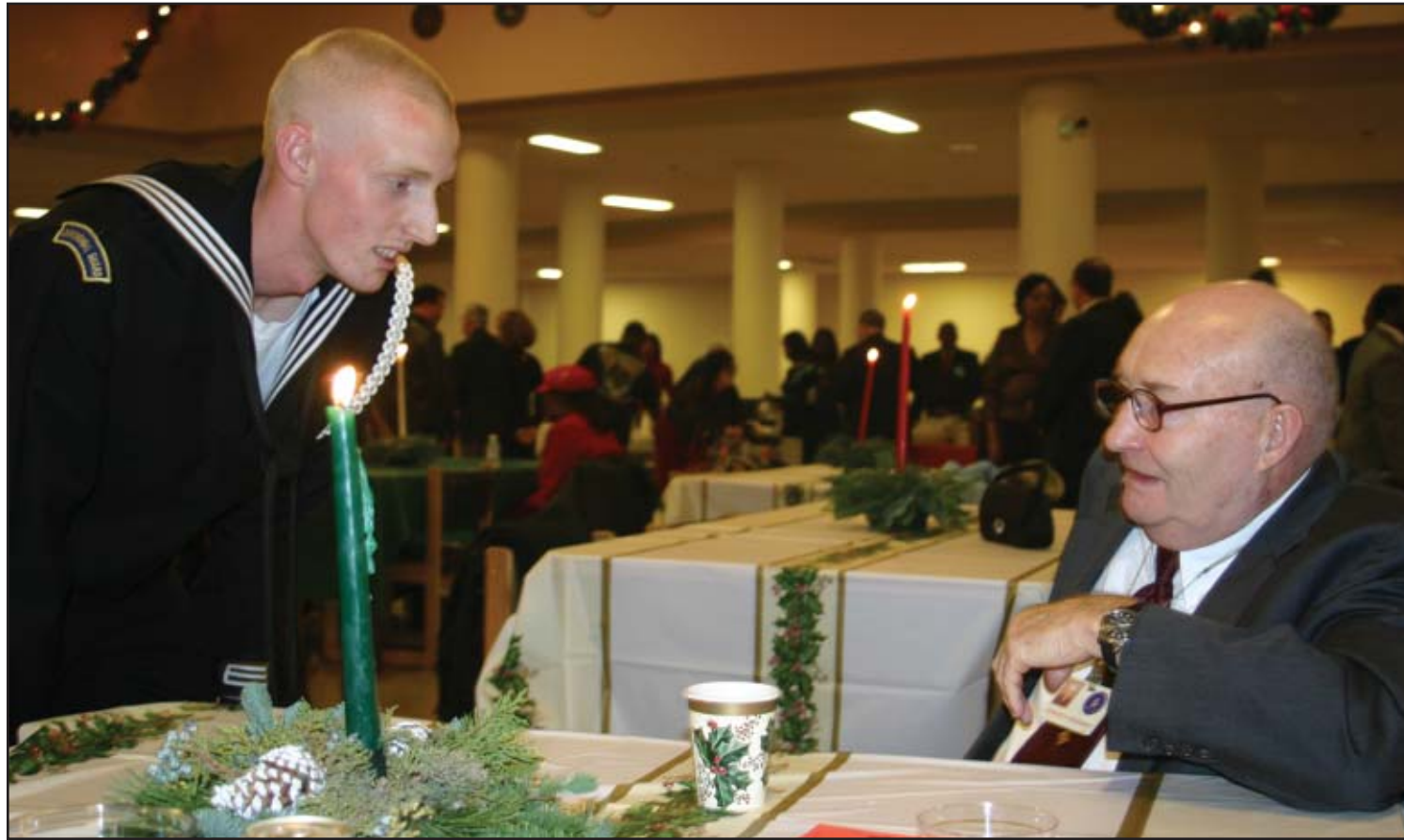
Active duty Navy volunteers spent the evening at the AFRH Dance with the residents.