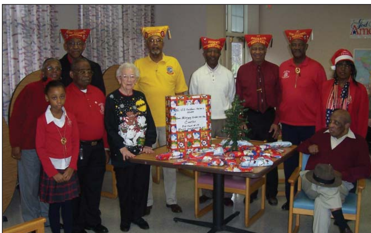
Members of the Military Order of the Cooties bring gifts to the residents of King Health Center.

The Military Order of the Cooties visited with the KHC residents on Saturday, December 20th. They served fresh coffee, tea, hot chocolate and donuts and as they do every month, sat with our residents and shared in memories of days gone by. The M.O.C group has been visiting our home for the past 25 years and in each of those years has donated a Christmas gift during this season. This year they donated a DVD/VCR player and warm socks to our residents. We appreciate their faithfulness over these many years to our home.