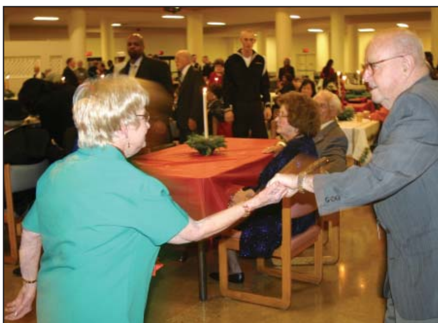
Residents dance to the music while others enjoy fellowship and good food.