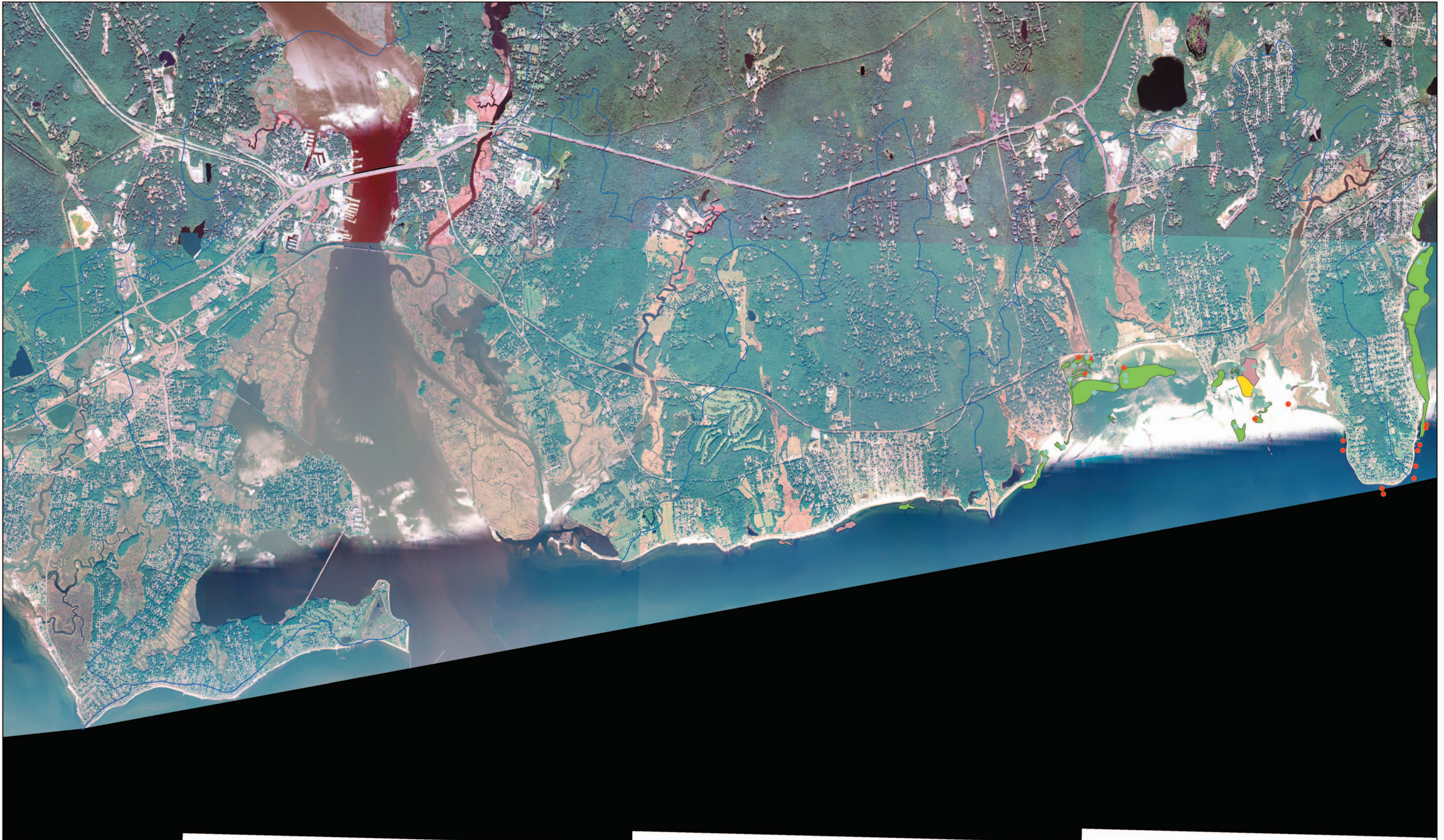
Study Area Locus Map