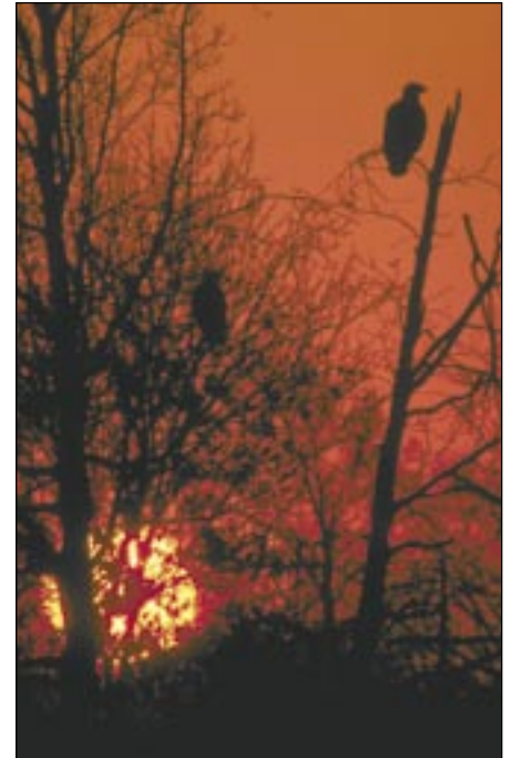
Bald Eagles at Sunset