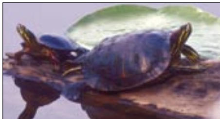
Red-eared Sliders