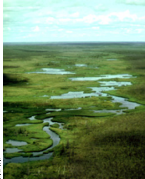
Extensive wetlands are a trademark of the Koyukuk Refuge.