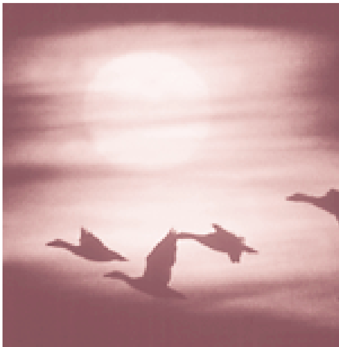
Snow geese/Maurice Tremblay