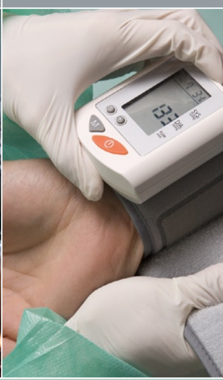
Corrections Today . . . and Tomorrow: A Compilation of Corrections-Related Articles