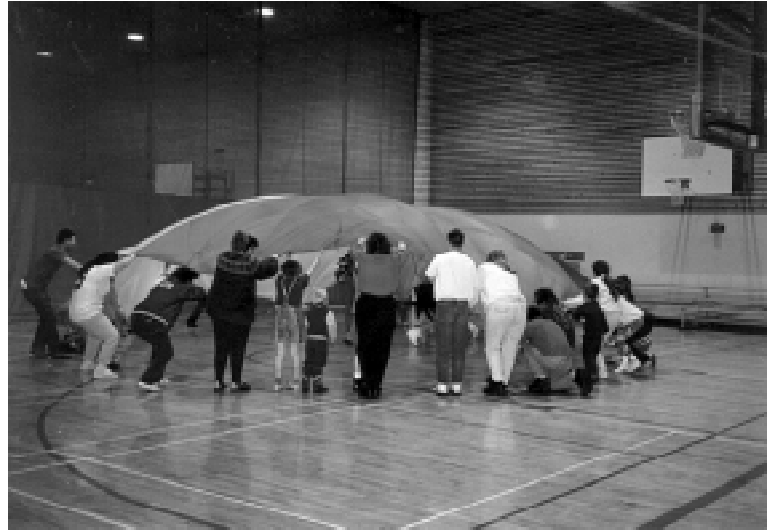
Family Focus Coalition and WSU/Spokane County Cooperative Extension

In response to this lack, the Girl Scout Council adopted innovative procedures to meet the needs of girls and to introduce neighborhood families to the benefits of Girl Scouting. A professional staff member is organizing and leading troop