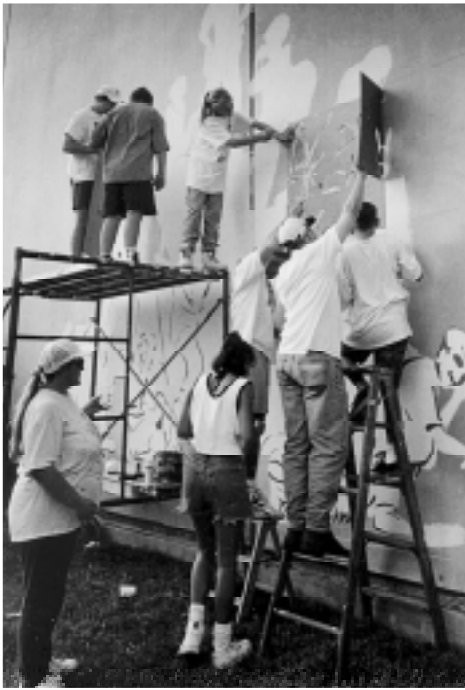
Youth pitch in to brighten up outside of Arlington’s Teen Center.

All meet in either the school gymnasium or school cafeteria as soon as school is over, and the activities carried out by the children involve a choice of age-appropriate physical exercise (such as circle games for the youngest children and tether ball or relay races for the oldest), arts and crafts for fostering fine motor skills, board games for broadening intellectual skills, and cooperative projects for developing social skills. Younger children ask for and receive more individual attention from the staff than children approaching adolescence, who are more interested in communicating with each other. With the occasional exception of a child who has been assigned to a solitary, short time out for breaking a rule known to all participants (such as pushing or shoving), and a num-