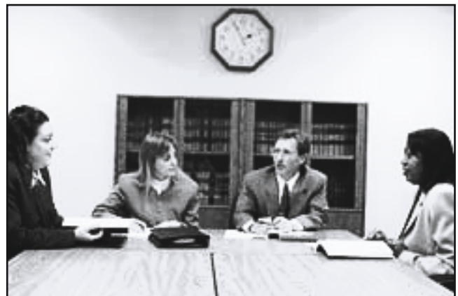
The Auditor General and staff study financial records of programs of state government.

The Auditor General, a legislative position established in the Constitution, operates on a year-round basis in auditing state agencies and higher education institutions. The Auditor General is