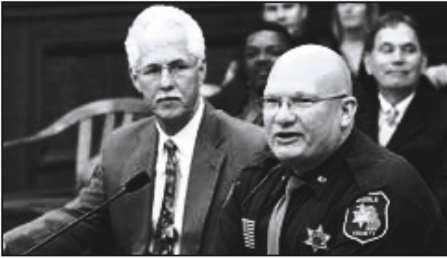
Testimony of experts and concerned citizens is vital to the process of gathering information.