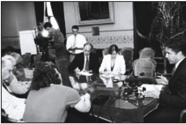
Legislator provides an update on the state budget talks to members of the Capitol press corps.

The same procedures related to approval of other legislation by the Governor also apply to appropriation bills, except that the Governor has line item veto authority and may disapprove any distinct item or items appropriating money in any appropriation bill. The part or parts approved become law, and the item or items disapproved are void unless the Legislature repasses the bill or disapproved item(s) by a two-thirds vote of the members elected to and serving in each house. An appropriation line item vetoed by the Governor and not subsequently overridden by the Legislature shall not be funded unless another appropriation for that line item is approved. Table 2 (page 30) shows the number of appropriations bills which had vetoes of specific items and the number of non-appropriation bills vetoed.