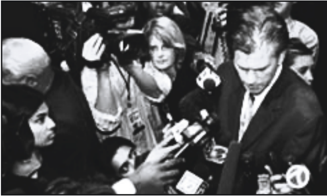
Legislator meets with the press to discuss developments regarding a recent budget crisis.

information from department officials regarding the executive budget, hold public hearings, and report their recommendations to the full committees.