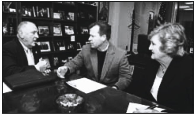
Local officials meet with a legislator to discuss transportation and other issues facing the county.

Another source of ideas for bills are the various proposed legislative programs which a lawmaker must consider and review. These programs take shape in various ways. Each year, the Governor delivers a State of the State address, which identifies those problems which the Governor believes to be most important. Caucus task forces and work groups offer numerous ideas and programs for consideration on a continuing basis.