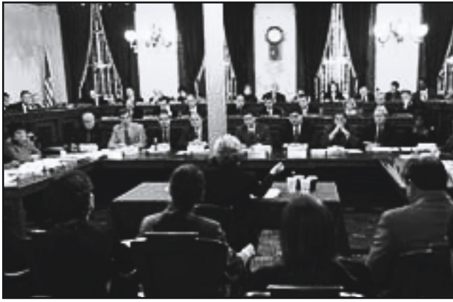
The Governor submitting her budget to a joint session of the House and Senate Appropriations Committees.

and in early June by the second house, and conference reports or final action is completed around July 4.