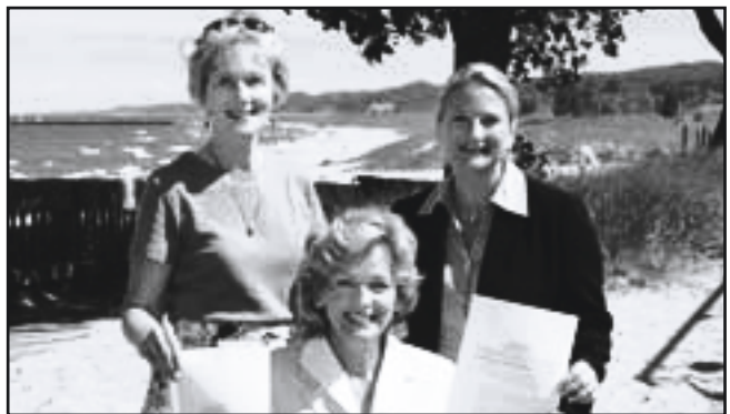
Legislators join the governor at a bill signing along the shoreline of Lake Michigan as she signs the state's new water protection package.

c. Choose not to sign or veto the bill. If the bill is neither signed nor vetoed, the bill becomes law 14 days after having reached the Governor's desk if the Legislature is in session or in recess. If the Legislature should adjourn sine die before the end of the 14 days, the unsigned bill does not become law. If the Legislature has adjourned by the time the bill reaches the Governor, he or she has 14 days to consider the bill. If the Governor fails to approve the bill, it does not become law.