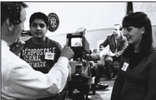
Students come from near and far to learn about the Michigan legislative process. These students from the Republic of Georgia and Pakistan learn how a legislator produces his local cable show.

An excellent way of finding out what it is actually like to work in the Legislature is to participate in a student intern program which may be offered by your local school district or a college or university. Other programs, sponsored by various civic organizations, involve young people from across the state in mock legislative sessions and are good ways of gaining firsthand knowledge and experience.