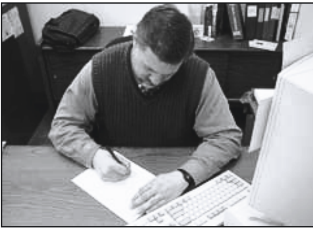
A well-written letter is usually the best way to communicate concerns and ideas to a legislator.

i. It is easy, particularly when dealing with legislators who disagree with you, to become angry and frustrated.