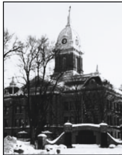
Court decisions as handed down in this county courthouse sometimes bring about the need to make changes in the law.

A decision that legislation is the answer to a problem is merely the first stage of the legislative process. After a bill has been introduced in the Legislature, the course it takes is subject to a more structured legislative procedure. At times the process can be swift. Other proposals may surface and resurface in successive sessions with little result. Many of these are never enacted. However, if a particular problem grows in magnitude or is subjected to increased attention, enough support may be generated to carry such a proposal through the remainder of the legislative process. During both the formulation and formal consideration of a proposal, however, there are many individuals, groups, conditions, and other influences that can affect how an idea eventually takes shape. In many cases, a combination of these sources