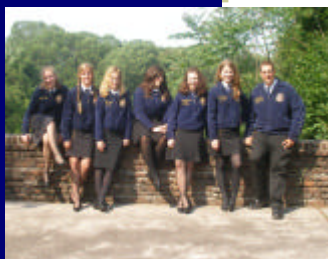
2008-09 New Jersey State FFA Officer Team