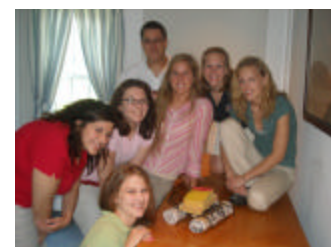
State Officers spent the weekend building relationships and setting team goals.

They also created the 2008-2009 state theme, "New Jersey FFA: Serve Today to Impact the Future." The state officers will use this theme to promote agricultural education and FFA during their year of service.