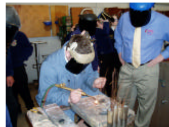
Interagency Agreements allow schools to receive equipment through grant opportunities.

We have been approved to receive two interagency agreements from the Department of Education again this year. The interagency agreements provide financial resources to operate the Office of Agricultural Education, provide professional development for teachers, operate New Jersey FFA and provide grants to schools and county colleges for agriculture food and natural resources.