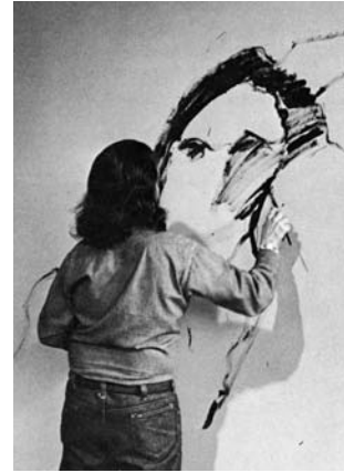
Scholder painting Television Indian (1974) in Scottsdale, Arizona, during filming for a documentary about the artist that aired nationally on PBS in 1975.