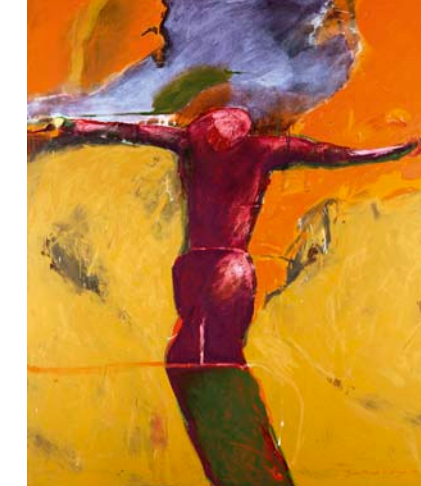
Human in Nature No. 7 , 1990. Acrylic on canvas. Collection of the Estate of Fritz Scholder.