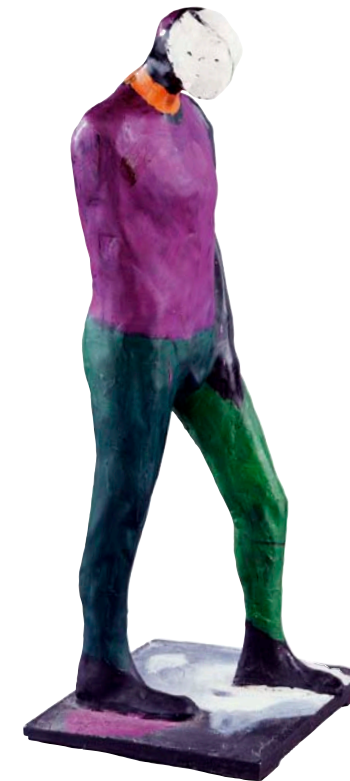
Painted Man No. 3 , 1992. Bronze and oil. Collection of the Estate of Fritz Scholder.

of Indians wrapped in the U.S. flag also became iconic. The images reflected the charged associations the flag had taken on during an era of antiwar protests and an irony-laced response to two centuries of damaging government policies.