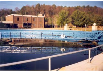
The Winnepesaukee River Basin Program, which is administered by DES, includes the wastewater treatment facility in Franklin.

Wastewater control activities also comprise a large portion of the division's operations. It oversees an extensive loan and state grant program for wastewater treatment facilities, reviews the engineering designs for such facilities, and ensures their proper construction and operation.