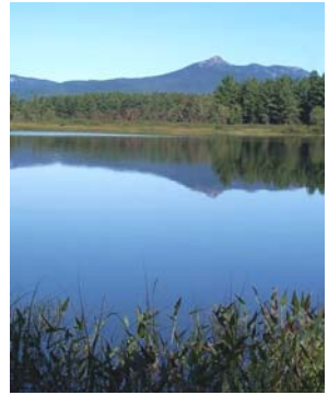
Moore's Pond in Tamworth.

Since the 1970s, the agency has been involved with sewage treatment projects amounting to hundreds of million dollars in federal and state grant money. These projects have resulted in the cleanup of hundreds of miles of water courses and thousands of acres of surface water. One notable project, the Winnepesaukee River Basin Program , has been responsible for significant water quality improvements. This DES-operated wastewater treatment