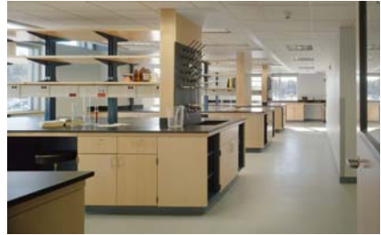
DES renovated its entire laboratory recently to provide state-of-the-art services.

The Planning, Prevention and Assistance Unit houses the programs and positions that provide technical and compliance assistance and environmental planning. The multi-media group includes the Pollution Prevention and Household Hazardous Waste Programs, the Small Business Ombudsman and Small Business Technical Assistance Program, the NH Occupational Safety and Health Consultation Service, and the Planning and Innovation Section.