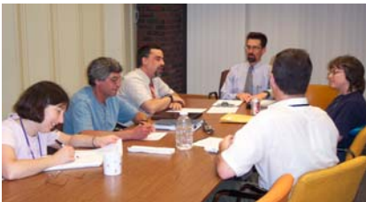
The DES Quality Assurance Team successfully developed and put in place a quality data system that is a model for state agencies across New England. The team showed outstanding leadership in promoting systematic collection and use of quality data for New Hampshire environmental programs.

Finally, the Public Information and Permitting Unit prepares and disseminates information to the public through press releases, educational fact sheets, pamphlets, reports, newsletters, website and audiovisuals; oversees the coordination of DES permits