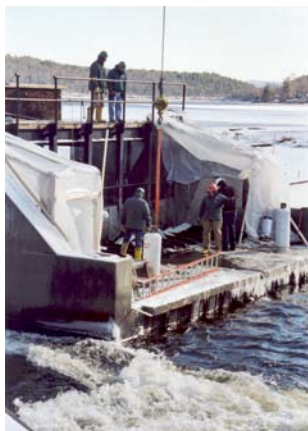
The DES Dam Maintenance crew works year-round to ensure public safety and wise management of the state's water resources.

tions of our state is another role of DES's Water Division. This includes construction, maintenance, and operation of state-owned dams and other water conservation projects throughout the state. Such projects enhance the state's economic welfare, create recreational benefits, and provide flood control.