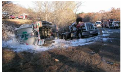
Waste Management staff, in conjunction with spill response contractors, are prepared to act rapidly to minimize the effects of the spilled oil or chemicals.

The NH Petroleum Reimbursement Funds provide financial assurance for owners of above- and below-ground petroleum storage facilities storing motor fuels, heating oils and motor oil. The fund provides insurance of up to $1.5 million for sites at which these fuels have leaked or spilled and caused a contamination problem. The funds are also available to affected parties to remedy contamination due to MtBE or other gasoline ethers. The funds disburse over $10 million per year to facility owners and affected parties for the cleanup of petroleum contaminated sites.