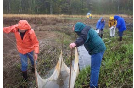
Volunteer marsh monitors provide DES with valuable data on the health of estuaries.

Managing and planning for water resources for present and future genera-