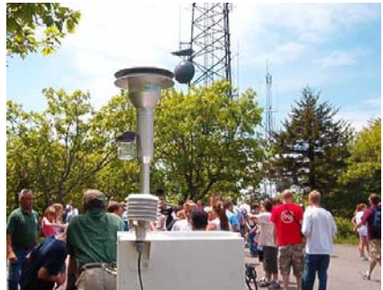
The DES Air Resources Division maintains an air quality monitoring station atop Pack Monadnock Mountain in southwestern New Hampshire.

The Air Resources Division is responsible for achieving and maintaining air quality in New Hampshire that is protective of public health and our natural environment. ARD is committed to promoting cost-effective, sensible strategies and control measures to address the many complex and inter-related air quality issues facing the state. These issues include, but are not limited to, ground-level ozone, small particle pollution, regional haze (visibility), mercury contamination, climate change, acid deposition, and air toxics. The components of New Hampshire's Air Quality Program are designed to respond to the many complex air quality issues through such tools as local, regional and national collaborations, data gathering, analysis, and control efforts.