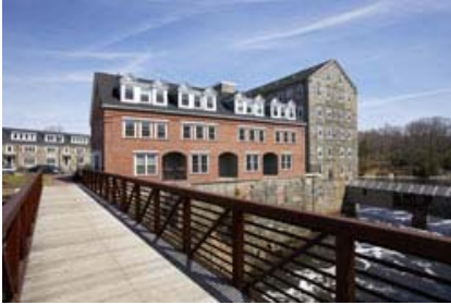
Bryant Rock townhouses in the restored Essex Mills buildings in Newmarket, NH were made possible through Brownfields redevelopment.

Brownfields are abandoned or underutilized properties where redevelopment is complicated by real or perceived environmental contamination. The Brownfields program at WMD works to clean up and aid in the redevelopment of these sites, which are often located in or near town centers. This helps to revitalize communities and deter sprawl by keeping jobs and services in our downtown areas. Further, it protects green-space areas from being consumed by new development.