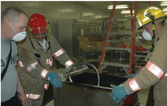
CPFD firefighters remove a fryer from the dining facility of Camp Phoenix after it caught fire the night of Sept. 9.

The firefighters used a garden hose to cool the sides of the fryer until they were able empty it and take it outside. Once the fire was out, the doors of the DFAC were opened to assist ventilation.