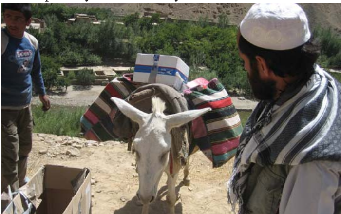
This donkey is hauling school supplies to a remote village with the ETTs of HSSC, who normally work at MOD.