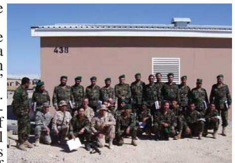
Graduates of the 205th Basic Computer Course, proud of their accomplishments.

After decades of war and upheaval, the ANA officer Corps steadily marches toward a better future.