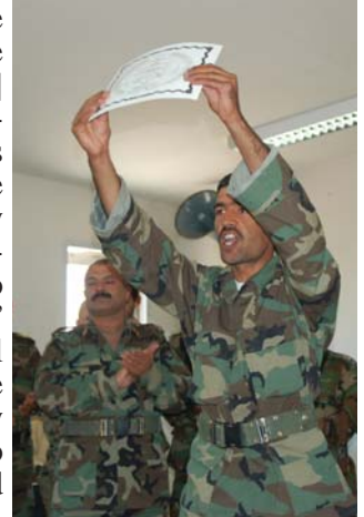
“Juwani!” an Afghan Soldier shouts at his homecoming.